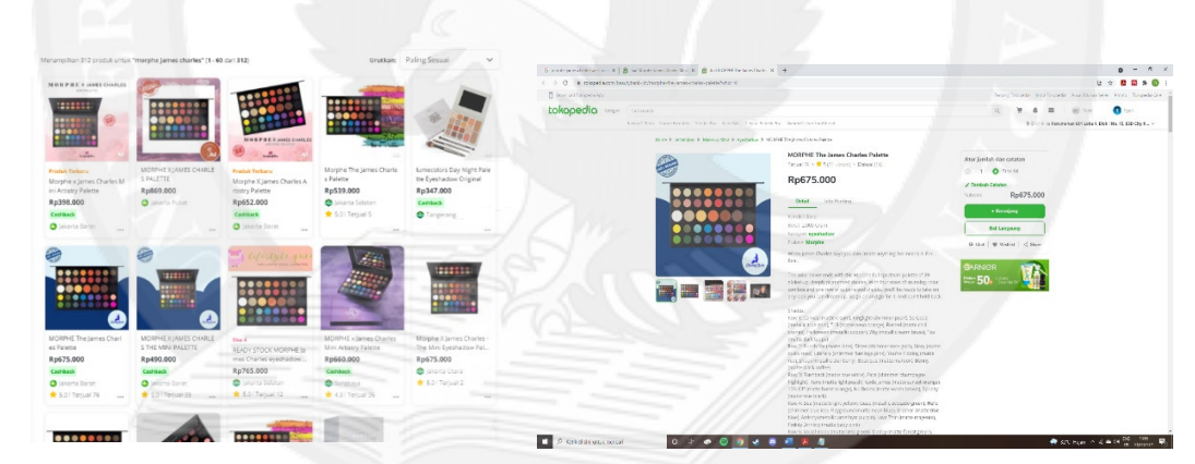
Figure 1.1.3 Morphe James Charles Palette Product being sell on Tokopedia platform

In the Figure 1.1.2, the organic keywords which Morphe receive around 1.4 million and around 135 thousand paid search traffic. With the top organic search is same as the paid ones Morphe, James Charles Pallete and Morphe Pallete. Between the position 51-100 their organic position which distribute is around 50%.