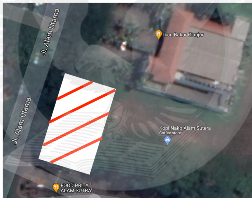
FIGURE 1 Map of Jalan Alam Sutera Boulevard

which connects the city of Jakarta with Tangerang. This toll serves as a support facility for businesses in Alam Sutera due to the access it provides for the residents of Jakarta to enter Tangerang. Alam Sutera also proves to be an area with a high potential for development growth as there has been new housing residences such as Sutera Winona, and commercial projects that are currently on process to be executed. Therefore, a greater proportion of potential customers for Hatsu Tori Restaurant. Precisely, the location of the establishment is at Jalan Alam Sutera Boulevard Utama No. Kav. 21, South Tangerang just as seen from the marked rectangle from the map of Figure 1 below.