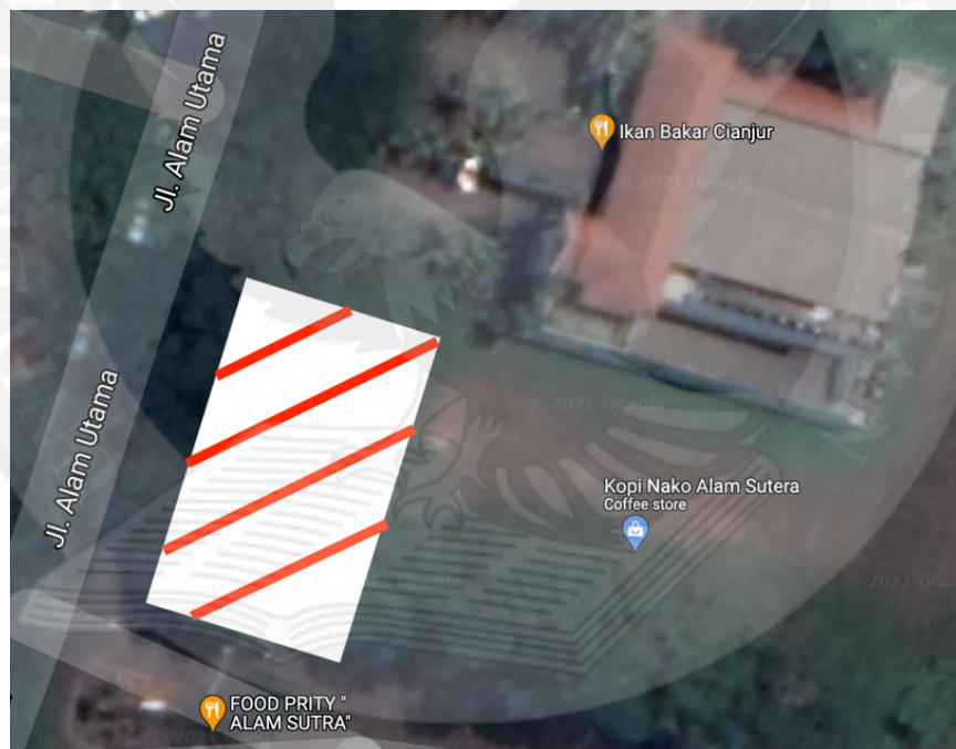
FIGURE 1 Map of Jalan Alam Sutra Boulevard

which connects the city of Jakarta with Tangerang. This toll serves as a support facility for businesses in Alam Sutra due to the access it provides for the residents of Jakarta to enter Tangerang. Alam Sutra also proves to be an area with a high potential for development growth as there has been new housing residences such as Sutra Winona, and commercial projects that are currently on process to be executed. Therefore, a greater proportion of potential customers for Hatsu Tori Restaurant. Precisely, the location of the establishment is at Jalan Alam Sutra Boulevard Utama No. Kav. 21, South Tangerang just as seen from the marked rectangle from the map of Figure 1 below.