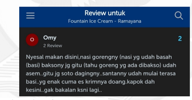
Figure 1. 4 Customer's Review of the Product

There are also several similar comments made by customers on google review regarding the unfriendliness of the staff. Some even mentioned they would not visit again for the second time or if there were other options, they would definitely not choose this cafe.