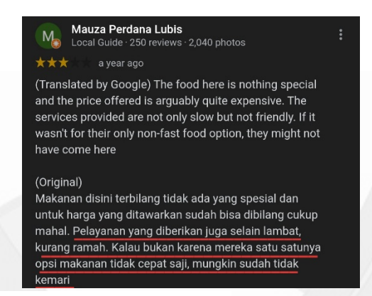
Figure 1. 3 Customer's Review of the Service

also very unresponsive when are asked about something, where they just answer it shortly and sometimes do not answer at all and just walk away.