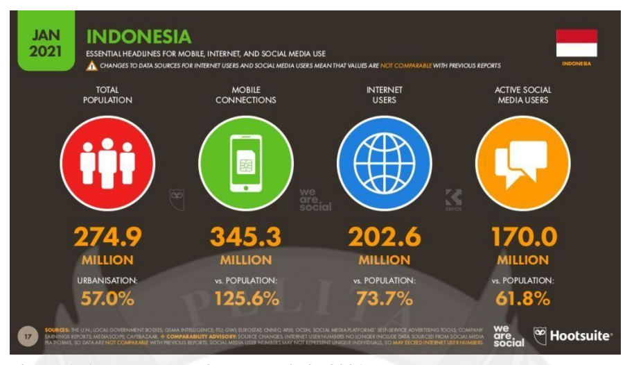
Figure 1. 1 Internet user in Indonesia in 2021, January

The revolution has changed a lot of sectors and one of them is the culinary industry. This revolution 4.0 in culinary industry is altering the way raw materials are purchased, food is made, packages are packaged, and goods are marketed in the