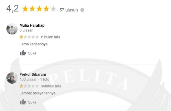
Figure 1. 6 The review of Grab Kitchen Pasar 3 per July 2021

JI. Pasar III No.30, Glugur Darat I, Kota Medan, Sumatera Utara