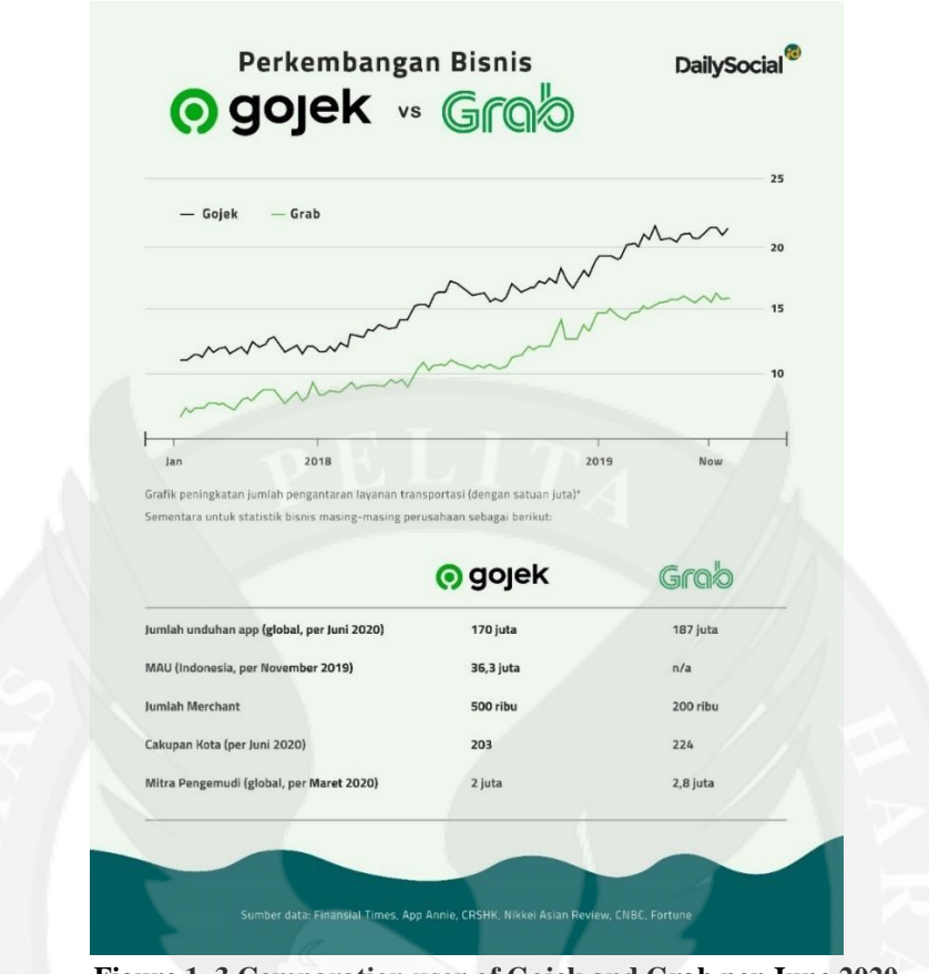
Figure 1. 3 Comparation user of Gojek and Grab per June 2020

Although the Grab users are higher than Gojek users, but according to the results of a survey conducted among 966 respondents, 51 percent of respondents frequently use the GoFood application, 48 percent use the GrabFood application, and only 1% use other delivery services when ordering food online during the COVID-19 pandemic (Daily Social, 2020). This shows that the customer still would prefer to choose using GoFood application rather than GrabFood for food online. It indicates that the customer loyalty at GrabFood is decreasing.