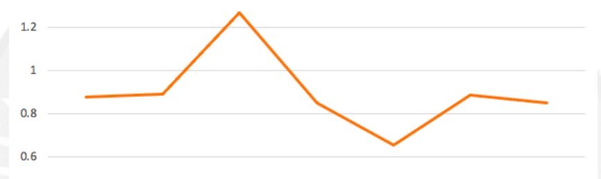
Figure 1.3 Calculated Profitability