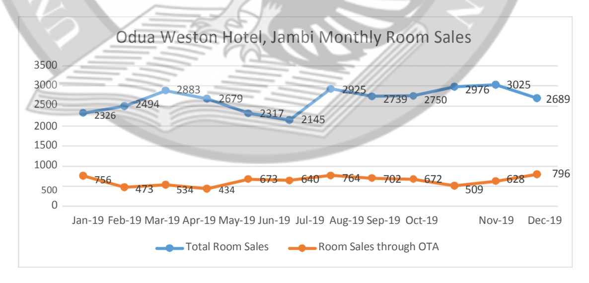
Figure 1.2 Odua Weston Hotel, Jambi Room Sales, Period: January – December 2019

Cooperation with OTA has been proven to contribute to the room sales of Odua Weston Hotel, Jambi as shown from the figure as follow: