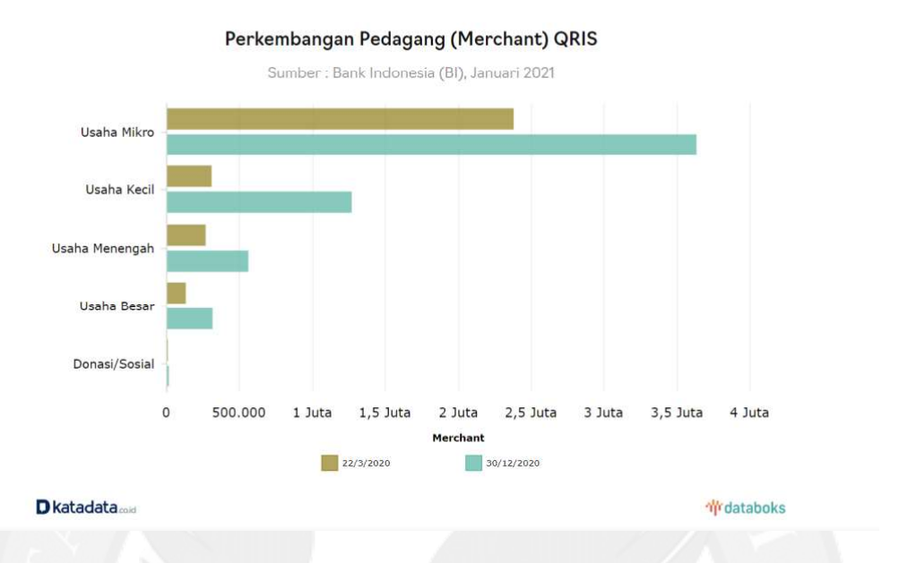
Figure 1.2 QRIS Merchant Development (Databoks, 2021)

SMEs are required to change, and innovate, their models to suit the customer expectations during the pandemic, such as digitalization in the form of utilizing digital payment platforms provided by e-wallets providers. Many businesses have chosen to incorporate e-wallet platforms as a way to increase financial efficiency. As shown in figure 1.2, the increased usage of the QRIS payment system amongst micro, small, and medium enterprises in Indonesia from Q1 and Q4 is significant. As Jakarta stands as the capital city of Indonesia, many have moved into Jakarta with hope of becoming successful by working in the nation's capital. As there are still a large amount of undereducated population all around Indonesia, most do not qualify for formal jobs, thus needing to find other ways to become successful. One of the ways to achieve this is by starting their own small businesses, under the UMKM category. Badan Pusat Statistik (BPS) of Jakarta recorded 1.1 million