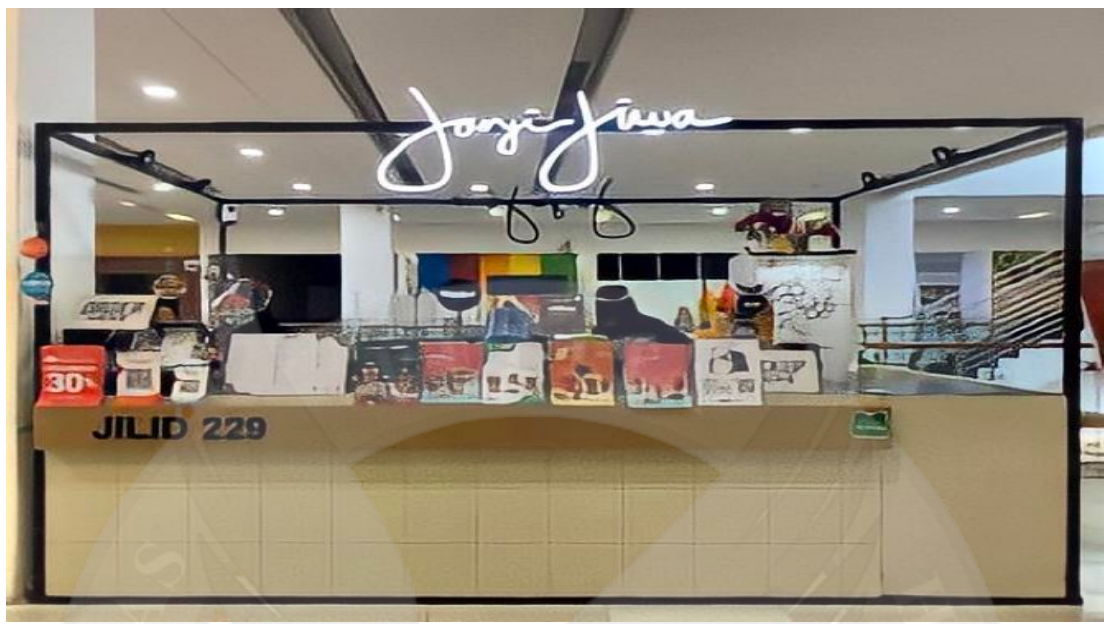
Figure 1.1 Janji Jiwa Jilid 229 Outlet in Binjai (2021)