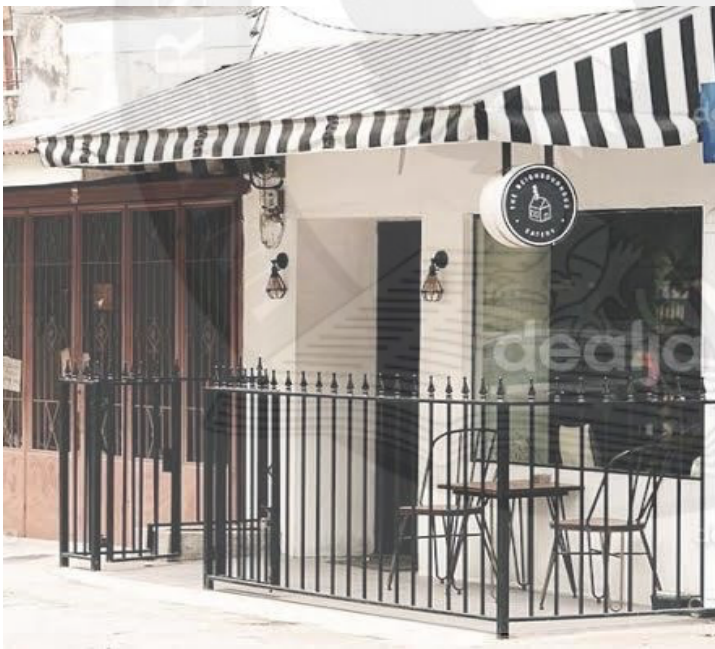
Figure 1.1 Outside the Neighbourhood eatery

Here is a cafe located in the middle of the city of Medan called the neighbourhood eatery Medan.