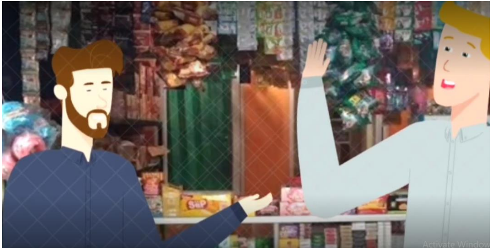
Figure 3. Animation 1

Attached is an animated video clip used in online service learning to instill anticorruption values in early childhood.