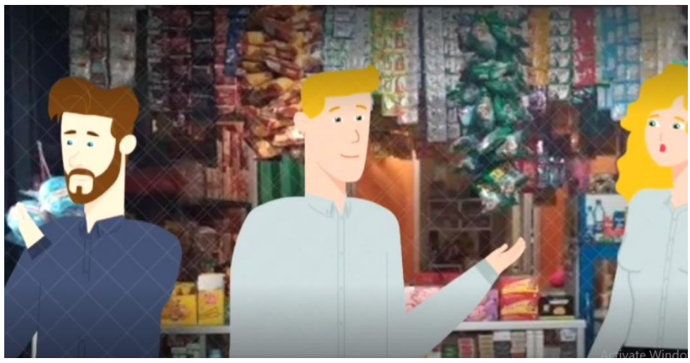
Figure 4. Animation 2

When the child is reminded not to be corrupt, they are expected to absorb the value of how to be honest with the use of money. The integrity value is important towards the daily interaction even in the small things.