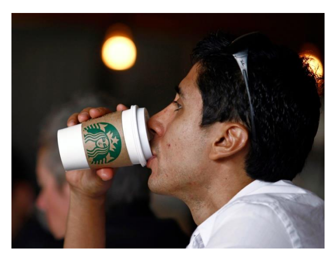
Figure 4. Starbucks Brand Identity Note. <a href="https://www.google.com">www.google.com</a> retrieved on 30 July 2017