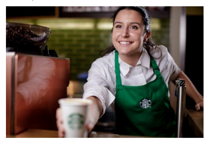
Figure 3. Starbuck's Staff Behavior Note.

consumers in choosing the best menu, and offer if they want more or less coffee shots and regarding the sweetness level or milk options. They are very much friendly.