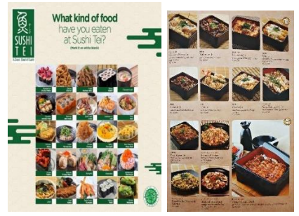
Figure 1.9 Sushi Tei Teuku Daud Medan's Menu

The third variable is food quality which is also a crucial factor in influencing consumer satisfaction. In other words, consumers satisfactions can improve if the quality of the food served is good. According to Qu in Majid et al (2018), stated that taste, portion size, dish temperature, menu diversity, and nutritional content are some of the factors that customers consider while evaluating the quality of food. Moreover, according to Anjarsari et al (2018), stated that the main product of a restaurant is its food, so food is a major factor in influencing customer satisfaction and customer behavior. Also, according to Kotler and Armstrong (2013) stated that product quality as the ability of the product to perform its functions, including the overall product, reliability, accuracy, ease of operation and repair, and other valuable attributes. The first evidence is in Figure 1.9 which shows the some of the menu in Sushi Tei Teuku Daud Medan which has menu diversity and has good presentation of food.