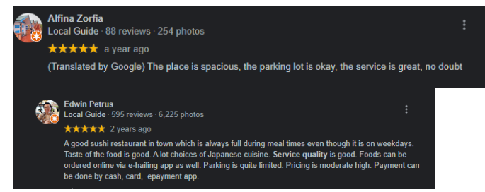
Figure 1.8 Sushi Tei Teuku Daud Medan Customer's Review on Service Quality

The third variable is food quality which is also a crucial factor in influencing consumer satisfaction. In other words, consumers satisfactions can improve if the quality of the food served is good. According to Qu in Majid et al (2018), stated that taste, portion size, dish temperature, menu diversity, and nutritional content are some of the factors that customers consider while evaluating the quality of food. Moreover, according to Anjarsari et al (2018), stated that the main product of a restaurant is its food, so food is a major factor in influencing customer satisfaction and customer behavior. Also, according to Kotler and Armstrong (2013) stated that product quality as the ability of the product to perform its functions, including the overall product, reliability, accuracy, ease of operation and repair, and other valuable attributes. The first evidence is in Figure 1.9 which shows the some of the menu in Sushi Tei Teuku Daud Medan which has menu diversity and has good presentation of food.