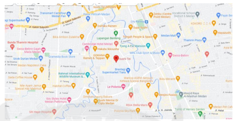
Figure 1.1 The location of Sushi Tei Teuku Daud Medan

Sushi Tei Teuku Daud, Medan as the object of this research is one of the most popular Sushi Tei branches in Medan. As the first branch of Sushi Tei in Medan, Sushi Tei Teuku Daud opened in 2004.