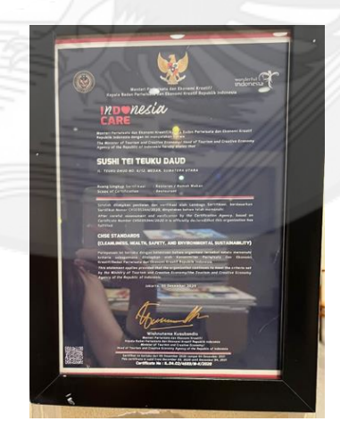
Figure 1.13 Sushi Tei Teuku Daud Medan's CSHE Standard certificate

Before having a revisit intention, the thing that customers will consider is