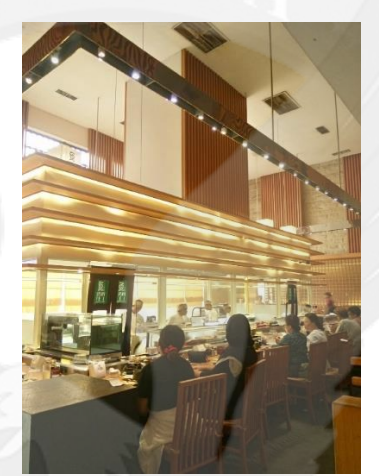
Figure 1.12 Interior Design and Open Kitchen in Sushi Tei Teuku Daud Medan