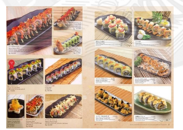
Figure 1.14 Sushi Tei Teuku Daud Medan Menu's Price

buyer's choice, price plays a significant role in determining consumer purchases, for that before setting a price, the company should look at some reference prices for a product that is considered quite high in sales. Meanwhile, according to Kotler and Armstrong (2016) price is the amount of money spent for a product or service, or a number of values exchanged by consumers to obtain benefits or ownership or use of a product or service. Moreover, according to Sudirman (2019), stated that price drives sales and will always be linked to consumers' financial capacities. Therefore, price is also one of the factors that can affect consumer satisfaction because the price set will be a benchmark in achieving satisfaction. In Sushi Tei Teuku Daud, Medan, the price set is a bit more expensive because their target market is upper middle-class family which the evidence can be seen in Figure 1.14. Although the price is a little more expensive, Sushi Tei Teuku Daud, Medan customers do not mind because for them the food served is worth the price paid, where the evidence can see the review from a customer in Figure 1.15 below stating "Premium price for a premium dish!".