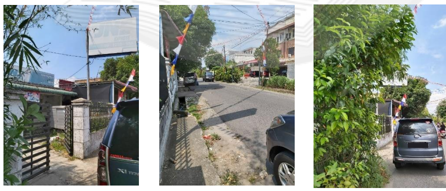
Figure 1.2. Less Visible JNE Metal Raya Branch's Location (2022)

Table 1.2. and Figure 1.1. show a significant decrease of monthly packages that JNE Metal Raya Branch has most of the times from January 2021 to July 2022, which may indicate that there may be some problems. To add more, those rooms for improvement that were mentioned above can be seen from some of the pictures and customer reviews towards JNE Express service that the writer found online as shown in Figure 1.2. and Figure 1.4.: