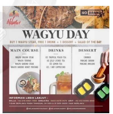
No Brand Promotion Event No Brand