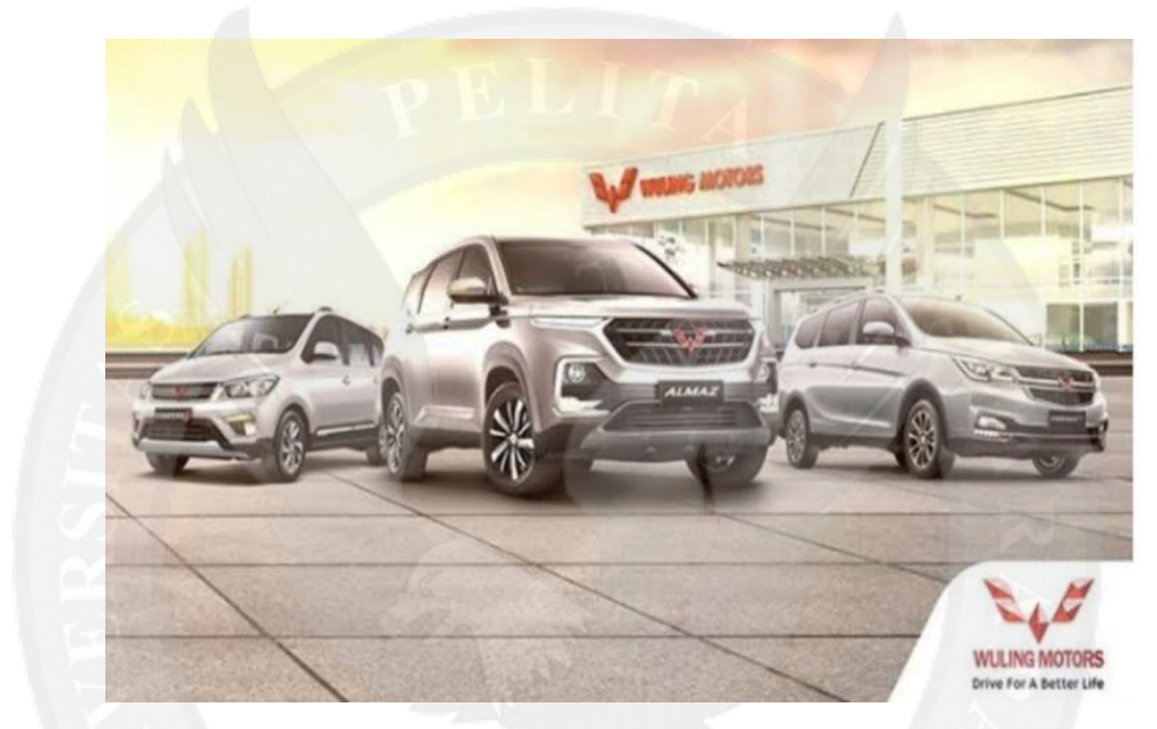
Figure 1.3 Wuling Car Products

Below is the car product that is offered by Wuling company towards the market: