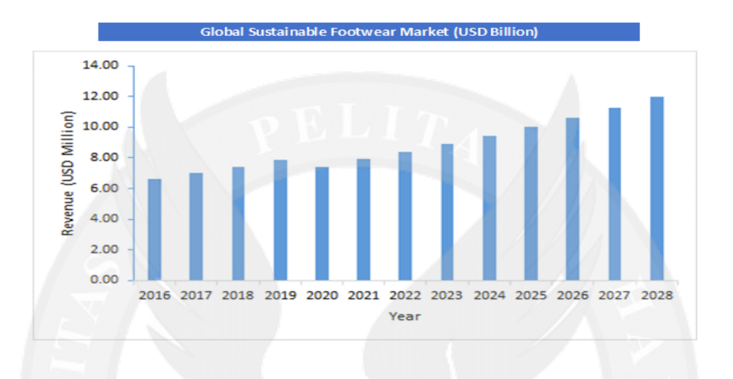
Figure 1.3 Global Sustainable Footwear Market Size, Share & Trends Analysis Report

share of 6.3 percent of total world production. Indonesia also ranks fourth as the largest consumer of footwear with a share of 4.5 percent (Kemenperin.go.id, 2019).