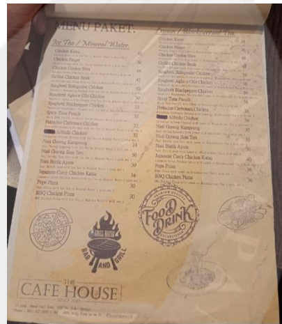
Figure 1.2 Cafe House's Menu

Café House Binjai has a rating of 4.6 out of 5 on Google review. However, there are some negative reviews regarding the café's service; this is a problem for consumers because customers need better service from the café. Regarding price, café atmosphere, and locations that do not have parking spaces for customer who drive cars.