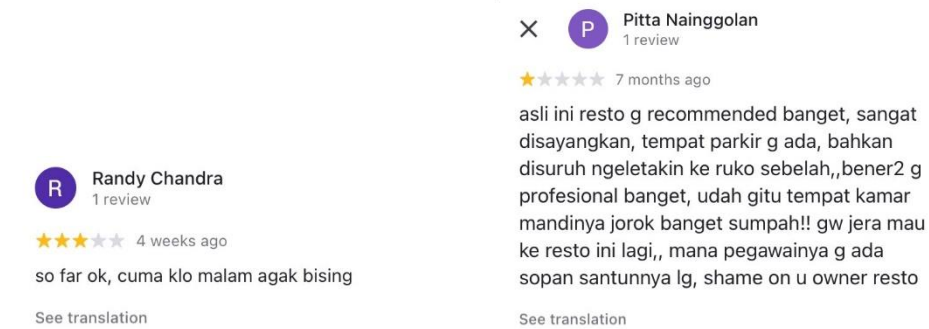
Figure 1.6 Customer Review of Cafe Atmosphere