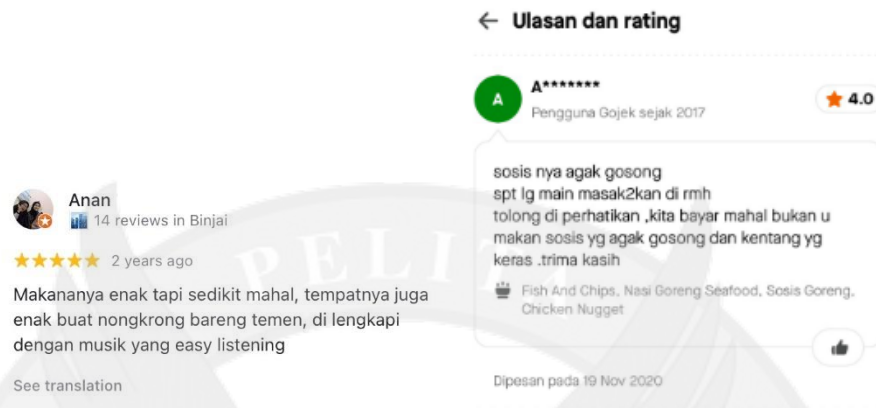
Figure 1.5 Customer Review of Price Perception

Perception variable can be observed in the reviews and ratings from Café House customers in Google Reviews in Figure 1.5 below.