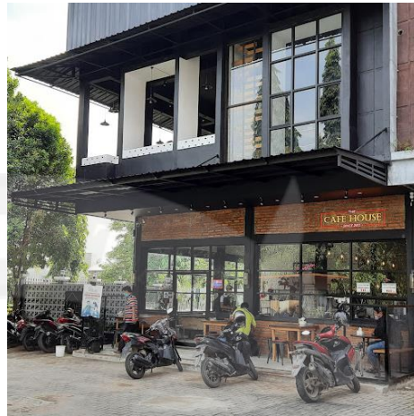
Figure 1.1 Logo and Location of The Cafe House

Café House Binjai was founded in 2013 on Jalan Jendral Ahmad Yani (GWBC Complex), Binjai City, North Sumatra. The Café House only started with a 1-floor room for customers to enjoy exciting dishes. A few years later, it was renovated to 2 floors because his space was minimal. Hence, they added one more base to expand customer satisfaction by having accessible wi-fi facilities. And until now, they continue to improve their quality, so they upgraded their cafe to be spacious and have outdoor seating to enjoy a meal with live music held on a beautiful evening. Their opening hours are 10.30 AM – 10.30 PM for Monday to Thursday and 10.30 AM – 11.45 PM for Friday to Sunday.