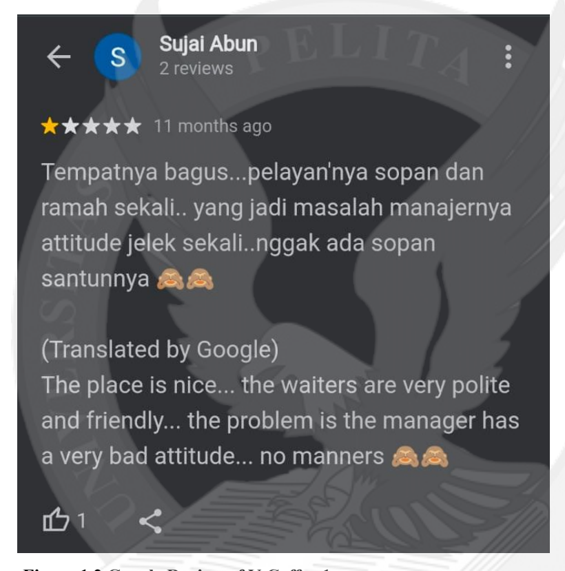
Figure 1.2 Google Review of V-Coffee 1

The goal of experiential marketing is to create an unforgettable experience that successfully appeals to target clients (Chang 2020). The writer found a google review that stated the manager of V-Coffee is very rude towards the customer. This will affect the experiential marketing of the customer in the sense of the feel at V-Coffee. The customer purchase decision might as well be affected because of this.