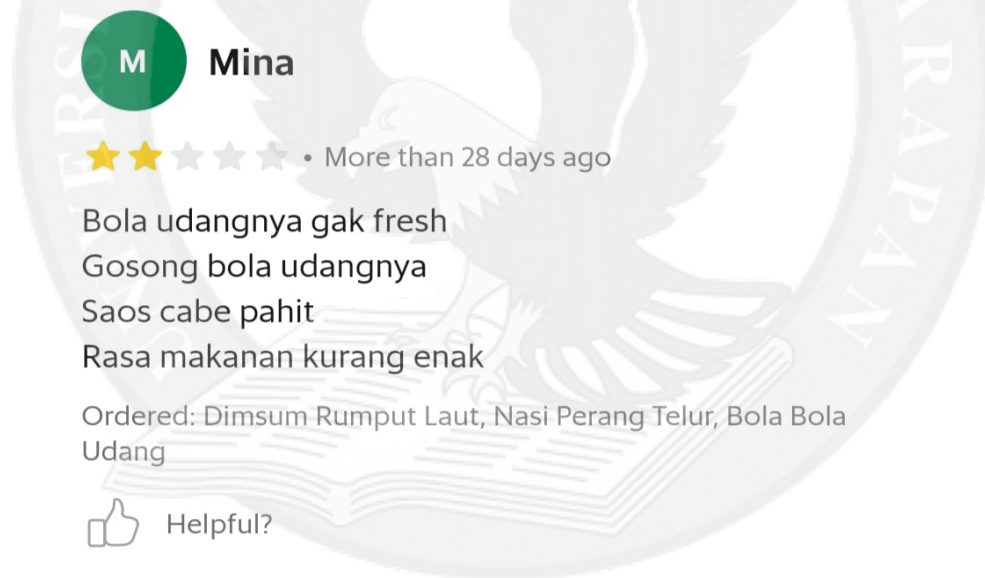
Figure 1.1 Review from Grab 1

With the variation of the product, V-Coffee needs to find a way to maintain the product quality so that it will not affect customer's purchase decision negatively. From figure 1.1 there is negative review regarding the product quality of V-Mart Coffee that might affect customer's purchase decision.