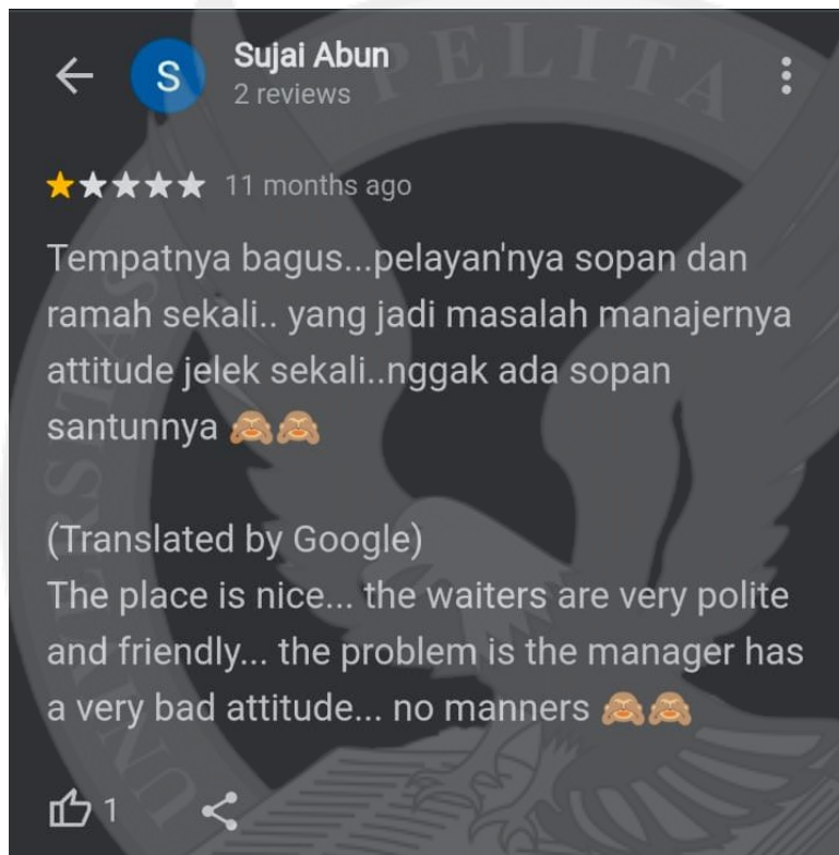
Figure 1.2 Google Review of V-Coffee 1

The goal of experiential marketing is to create an unforgettable experience that successfully appeals to target clients (Chang 2020). The writer found a google review that stated the manager of V-Coffee is very rude towards the customer. This will affect the experiential marketing of the customer in the sense of the feel at V-Coffee. The customer purchase decision might as well be affected because of this.