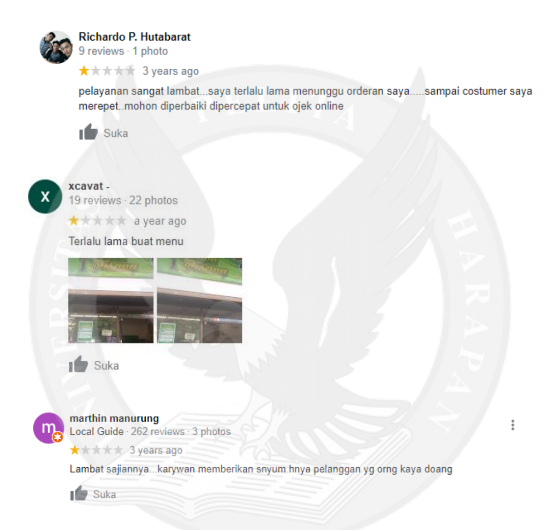
Figure 1. 2 Reviews about Service Quality at Restoran Pohon Pisang Source: Restoran Pohon Pisang (2023)

On the quality of service at the Restoran Pohon Pisang, there are also still complaints from consumers en in the quality of service owned. Here are some complaints about the quality of service.