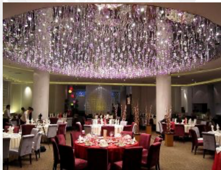
Figure 1.3 Decoration of Taipan Restaurant

Taipan Restaurant, Medan has a luxurious brand impression because it is supported in terms of restaurant design is luxurious, classic, and classy.