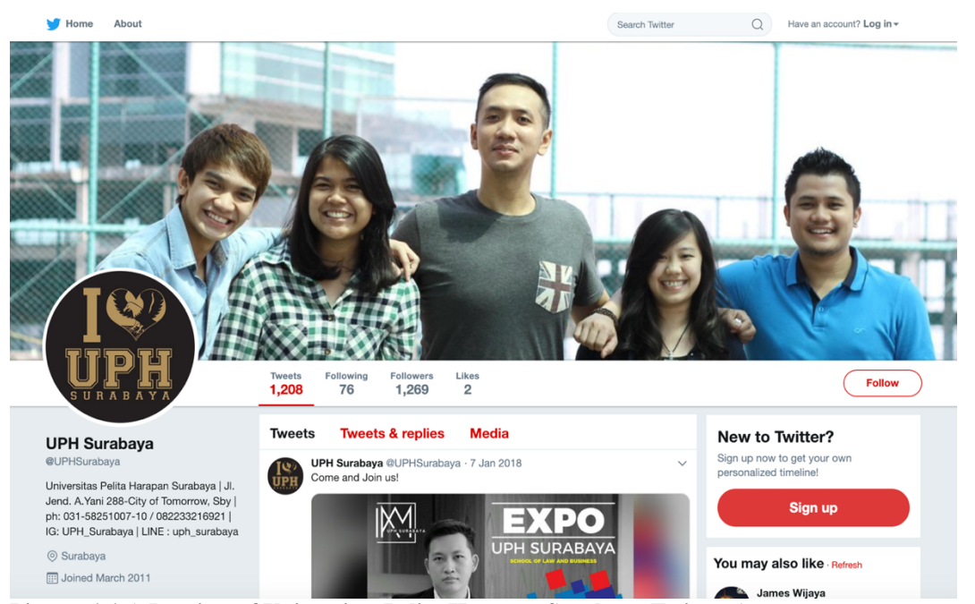
Picture 1.1 A Preview of Universitas Pelita Harapan Surabaya Twitter Account

Below are Universitas Pelita Harapan Surabaya current social media accounts: