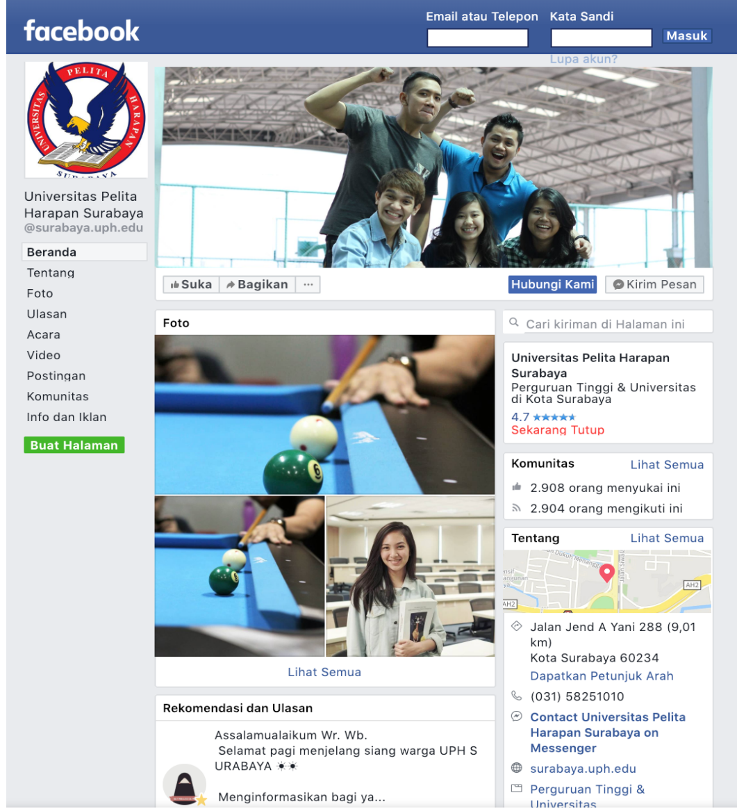
Picture 1.2 A Preview of Universitas Pelita Harapan Surabaya Facebook Account