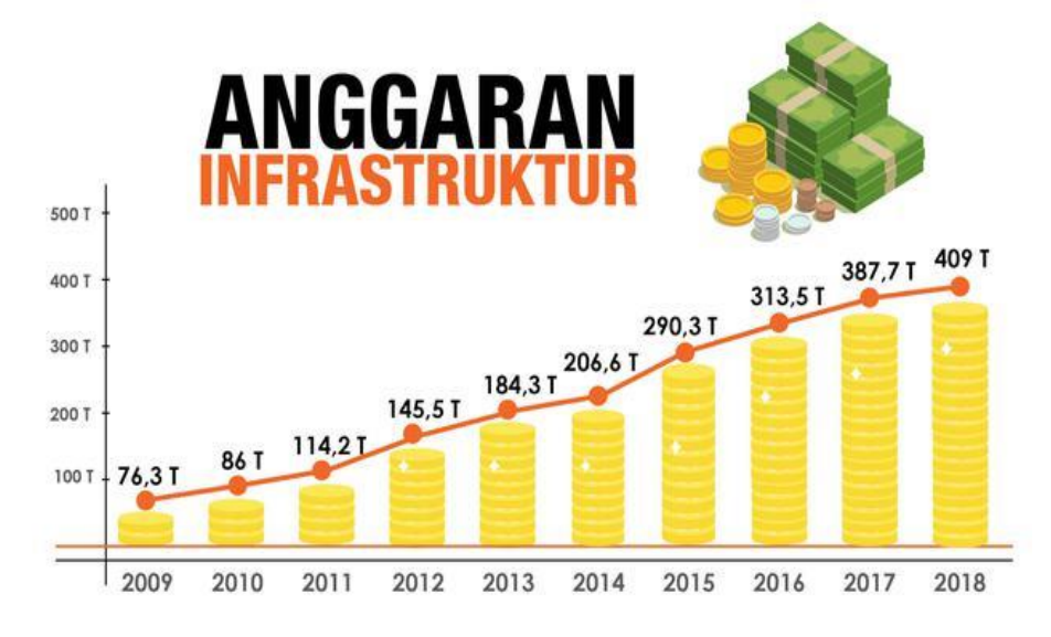
Figure 1.2 - Indonesian Infrastructure Budget

This infrastructure development makes property fields also increase. A number of infrastructure projects have a positive effect on the property sector, including elevated toll roads, rail-based transportation modes or mass rapid transit (MRT), and the construction of light elevated transit (LRT). The mass transportation system in this city has a very real impact on the rising prices of local settlements. The existence of new transportation corridors or changes in the mass transportation system will increase the potential for property investment in a city. (Infrastruktur Dongkrak Properti, 2018). This can be proven by the number of high-rise buildings being built. In the past, multi-storey buildings were rarely found, but along with the development of infrastructure and global developments, tall buildings have become very common sights. Especially in areas such as major cities in the world, high-rise buildings are not surprising. Even people competing to make buildings as high as possible to get the title of being one of the tallest buildings in the world. In Indonesia, especially in big cities like Jakarta, Bandung, and Surabaya, the views of tall buildings are seen in almost all regions.