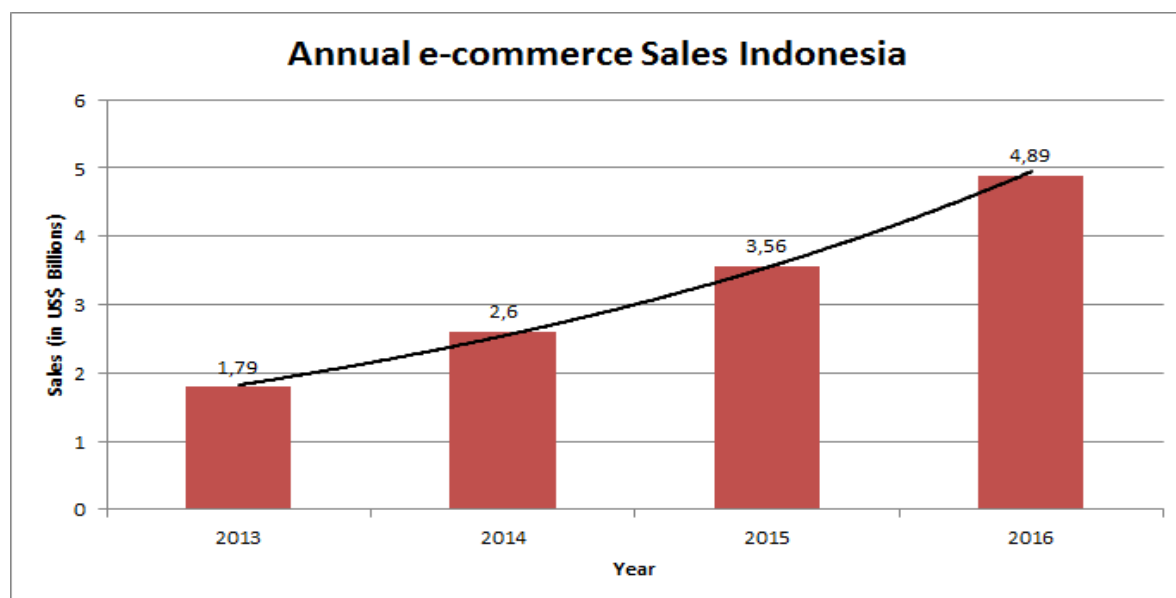
Figure 1.1 Annual e-commerce sales Indonesia.

As the potential of e-commerce grows in Indonesia, the competition between online shops is increasing as more shops enter the industry. The competition has begun to become so intense that it has been addressed by the Head of the Creative Economy (Kepala Badan Ekonomi Kreatif) (Jamaludin, 2015).