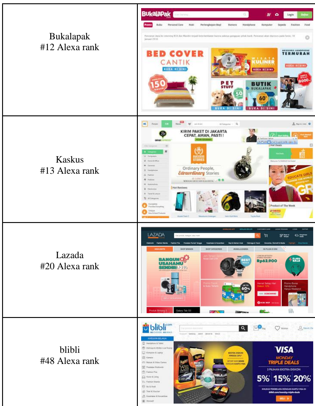
Table 1.2 Front Pages of Indonesia's Most Popular Online Stores.

source: https://pintarkomputer.org/2016/01/7-toko-online-terbaik-dan-terpopuler-di-indonesia/