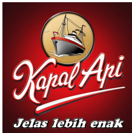
Figure 1.3 (Kapal Api logo – 2014, Source: https://twitter.com/kapalapi_id )

From all those Coffee Company in Indonesia, the one that very famous is Kapal Api. Kapal Api is coffee brand owned by PT Santos Jaya Abadi under PT Kapal Api Global. This is a brand of coffee that has been known to the people of Indonesia since 1927. This brand also was awarded Indonesia Best Brand Award to the 14th time in 2015. (Prahadi, 2015). Kapal Api Coffe also managed to reap more than 50% of the Indonesia national coffee market. In fact, Kapal Api also widened the wings to international market. (SWA Online, 2011)