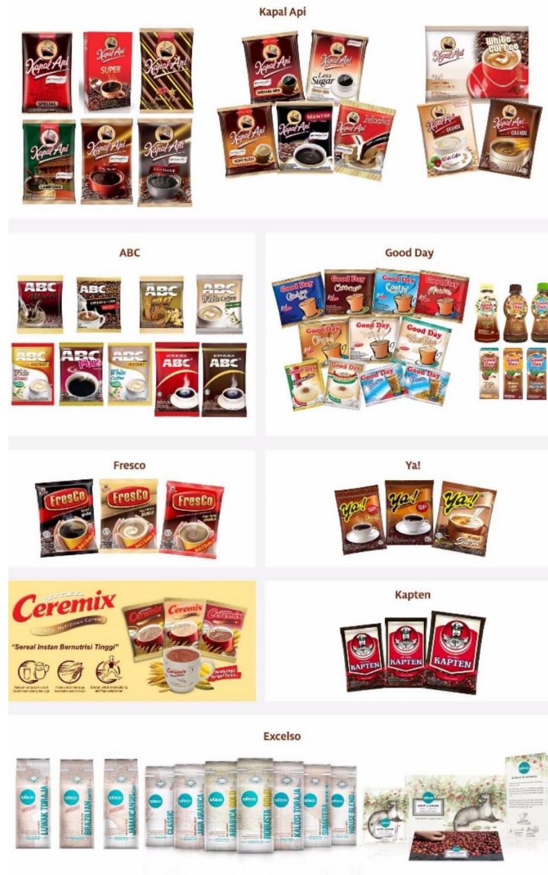
Figure 1.4 (PT Santos Jaya Abadi Products – 2017)

achieve a sustainable market leadership position by delivering excellent value to our customers through continuous innovation, world class processes, financial strength and great people. (Kapal Api Global, 2016)