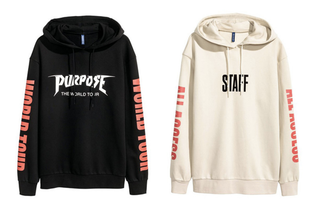
Figure 1.2: H&M product collaborating with Purpose Tour Merchandise

which H&M can take into account when they are importing the product to the store.