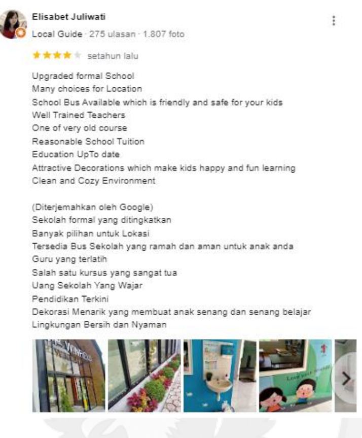
Image 1.27 Perceived Quality – Google Review about Perceived Quality towards Y.P. Karya Anugerah (Winfield) Formal School

Source: Image Obtained from Google Review, downloaded at 14<sup>th</sup> March 2023