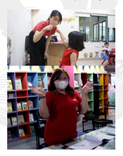
Image 1.34 Value Congruity – Teachers and Staff's Friendly Personality Source: Image Obtained from Y.P. Karya Anugerah (Winfield) (2023)

Source: Image Obtained from Y.P. Karya Anugerah (Winfield) (2023)