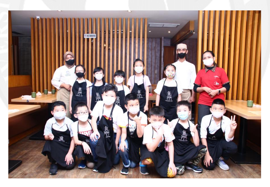
Image 1.15 Memorable Experience – Outing to Sushi Tei

Social Benefit is the idea that customers are more likely to identify with brands that enable them to connect with significant individuals, groups, communities, or