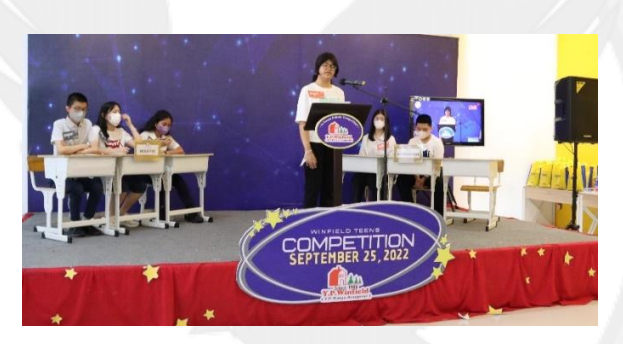
Image 1.30 Intra-organizational Competition – English School 2022 Debate Competition