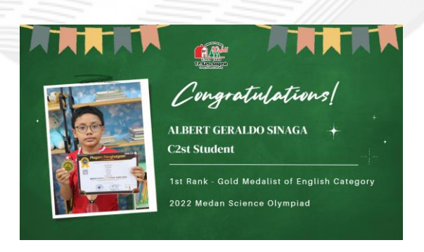
Image 1.7 Consumer-Brand Identification – English School Students Representing Winfield and Winning Competitions

Source: Image Obtained from Y.P. Karya Anugerah (Winfield) (2023)