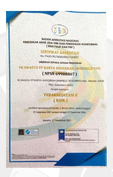
Image 1.23 Perceived Quality – Winfield Titi Kuning Formal School Accreditation Certificate

has been a part of the educational community for 35 years as of right now. This amount of experience demonstrates Winfield's strong quality, which has helped it earn the community's long-term trust.