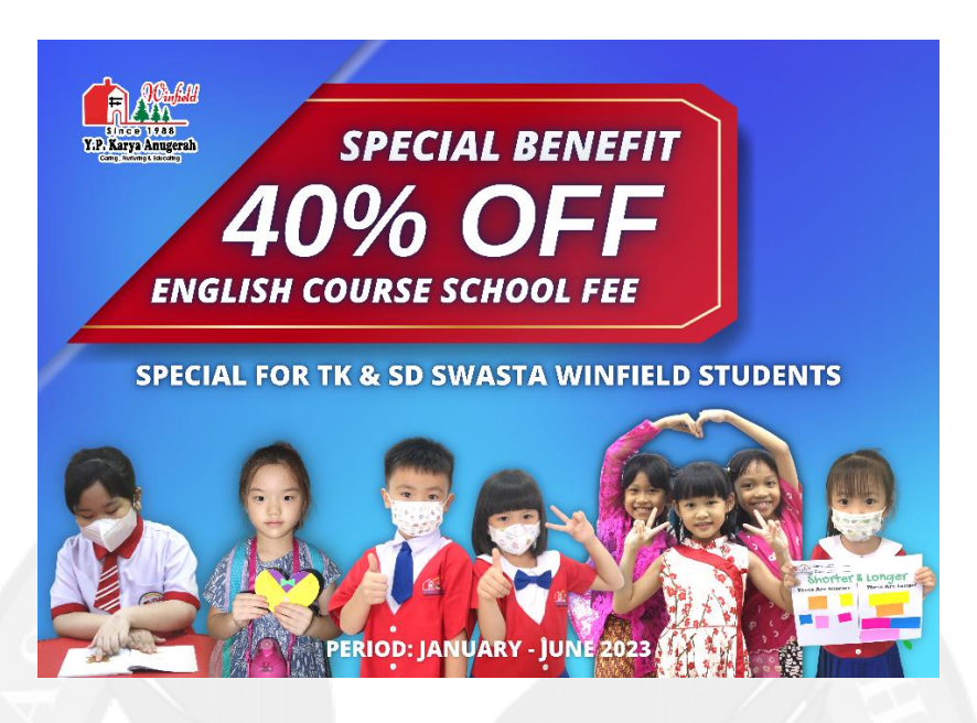
Image 1.32 Inter-organizational Competition – English School Promotion