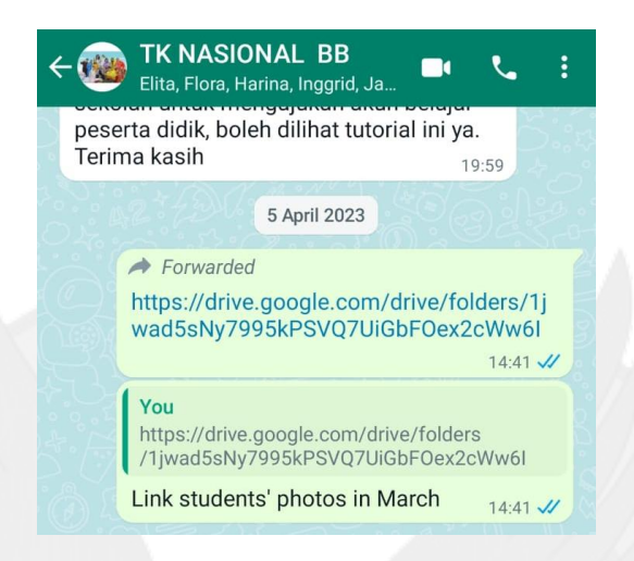
Image 1.17 Brand Social Benefit – Formal School Documentation Keepsake for Parents

Source: Image Obtained from Y.P. Karya Anugerah (Winfield) (2023)