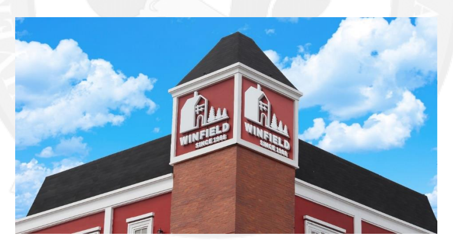
Image 1.26 Perceived Quality – Winfield English School (Since 1988)