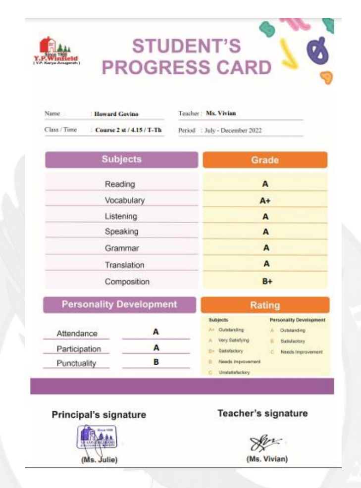
Image 1.22 Corporate Communication – English School Student's Progress Card