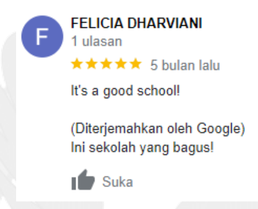
Image 1.4 Word-of-mouth as Part of Customer Loyalty – Google Review about Y.P. Karya Anugerah (Winfield) Formal School

Winfield and remained committed to the school for many years, as well as by their positive sharing on Google review like the ones shown below.