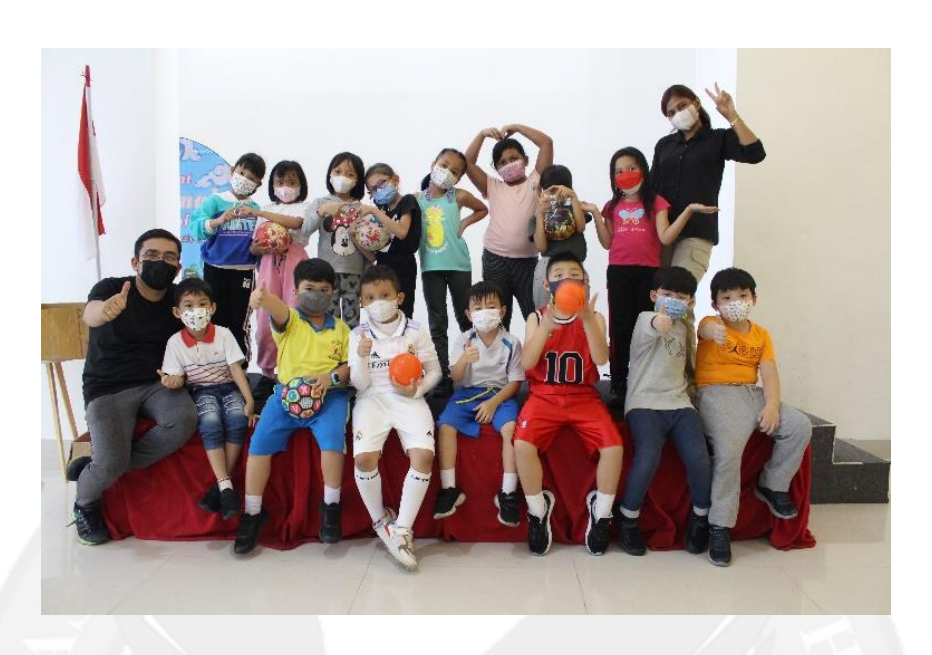
Image 1.14 Memorable Experience – Formal School 2022 Sports Day