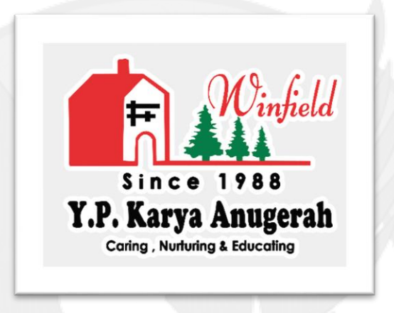
Image 1.1 Y.P. Karya Anugerah (Winfield) Logo Source: Image Obtained From Y.P. Karya Anugerah (Winfield) (2023)

At the moment, Winfield has three branches, each of which is situated in a different part of Medan. The addresses are Jl. Bandar Baru No. 4, Jl. Hasanuddin No. 25/9E, and Jl. Jend. A. H. Nasution Komplek Titi Kuning Mas Blok F1-4. All three branches of this research will be examined.