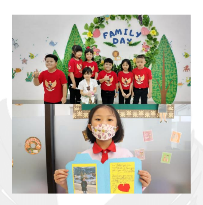
Image 1.33 Value Congruity – Formal School 2022 Family Day & Father's Day Celebration