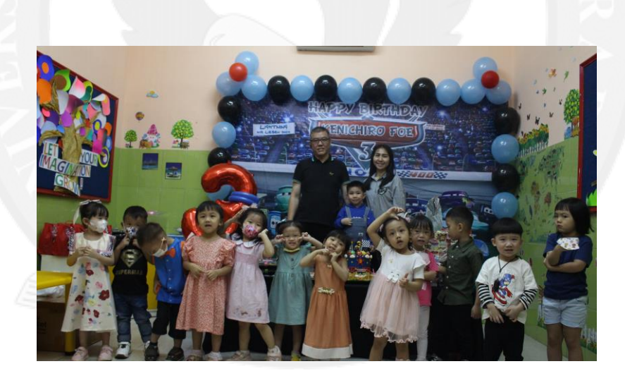
Image 1.18 Brand Social Benefit – English School Birthday Celebration for Students

Source: Image Obtained from Y.P. Karya Anugerah (Winfield) (2023)