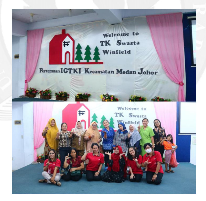
Image 1.8 Brand Personality Congruence – Formal School IGTKI Meeting

Brand Personality Congruence is defined as the relationship between consumers' self-concepts and brands, stating that consumers are more likely to display favorable attitudes toward brands that they perceive to be congruent with their own self-image and less likely to favor brands that are incongruent with it (Pradhan et al., 2019). This school has been working to remain an up-to-date institution that abides by the rules set forth by the local education authority. This is demonstrated by involvement in educational gatherings like IGTK (Ikatan Guru Taman Kanak-Kanak Indonesia), where topics like learning media, Bimtek BOP 2023, and transitioning to the Merdeka Curriculum are discussed. Additionally, Winfield English Course also holds weekly staff and teacher meetings to ensure students receive the best possible education.