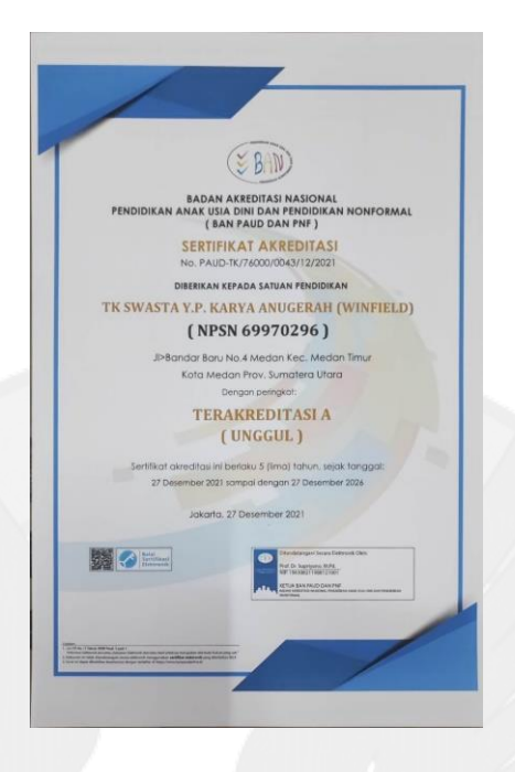
Image 1.25 Perceived Quality – Winfield Bandar Baru Formal School Accreditation Certificate