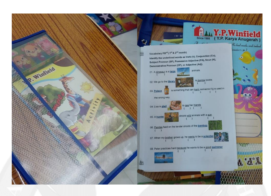
Image 1.13 Distinctiveness – Winfield English School's Books