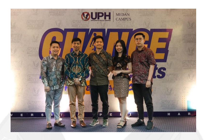
Image 1.10 Brand Prestige – Invited to a Networking Event at UPH Medan Campus