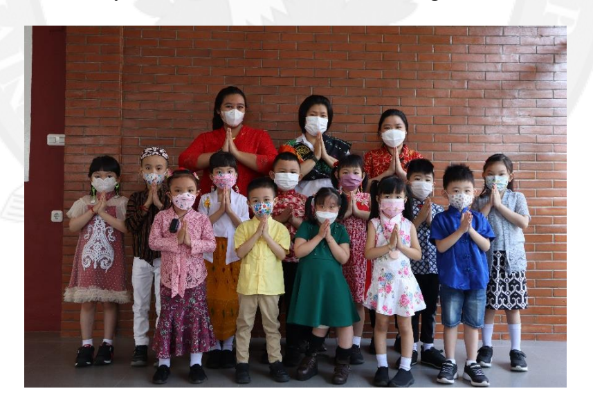
Image 1.12 Distinctiveness – Formal School Wednesday Cultural Day

through the acquisition, utilization, and disposition of consumer goods for the development and enhancement of one's social and personal identity. Distinctiveness is a crucial concept that enables customers to quickly distinguish one brand from others. The focus on literacy and culture is one of Y.P. Karya Anugerah (Winfield) distinguishing features. Winfield formal school has admitted to being a literacy-focused and cultural school, and on Wednesdays, all teachers, staff, and, students are required to dress in cultural outfits. Furthermore, Indonesian cultures are highlighted in the classroom interior design so that students can learn more about them. As for the English School, Winfield has differentiated itself by making its own books for English Course. These books can only be obtained when studying at Winfield and are not sold anywhere out of the school. The materials provided by Winfield are also designed upon and based on the ability of students at each level of the English course.