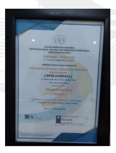
Image 1.24 Perceived Quality – Winfield Hasanuddin Formal School Accreditation Certificate