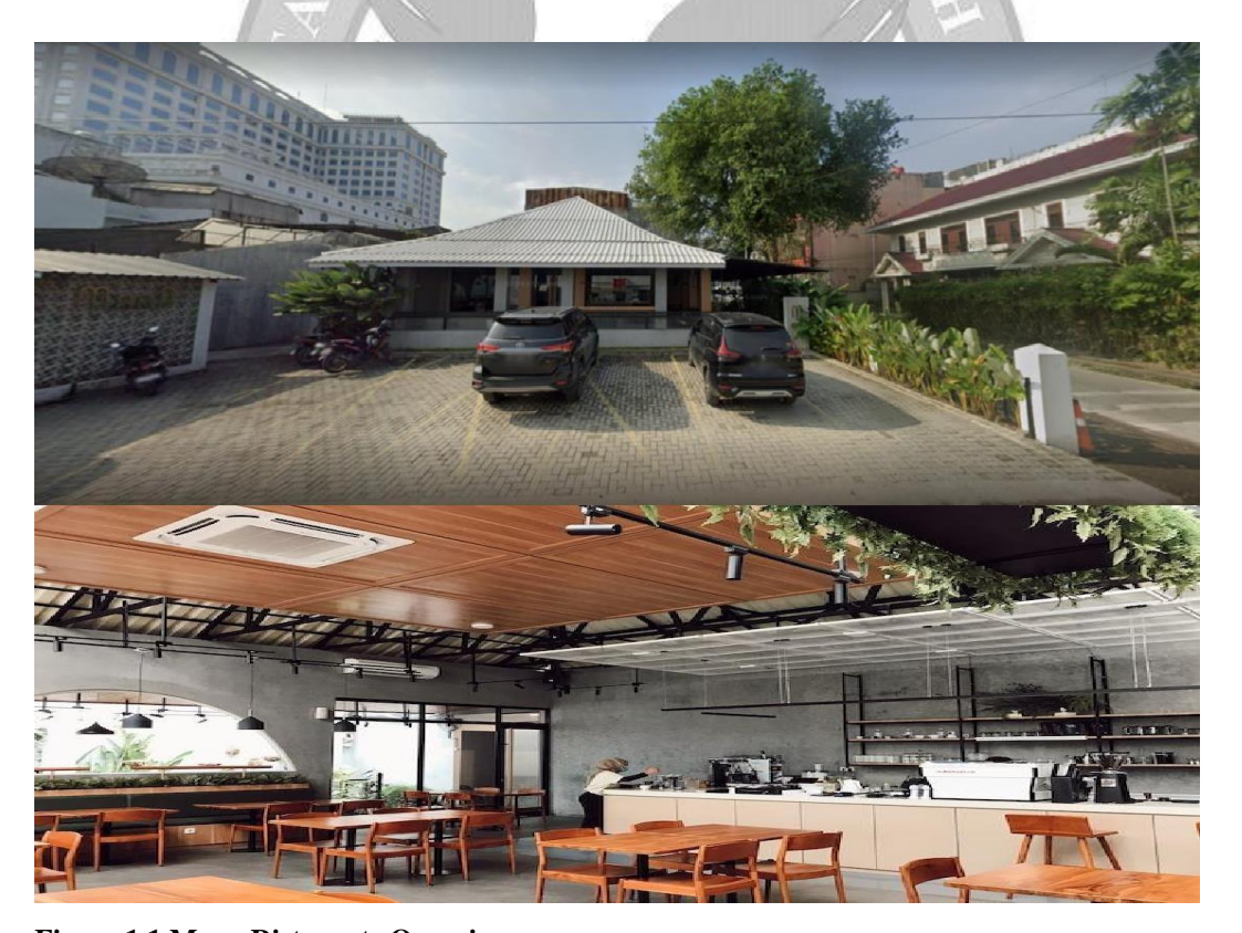
Figure 1.1 Mano Ristorante Overview

Mano Ristorante is a new cafe with a cozy feel that is suitable as an Instagramable place with a wide selection of western-themed food and is located on Jalan Teuku Umar No. 7, Medan. The following is an overview of Mano Ristorante: