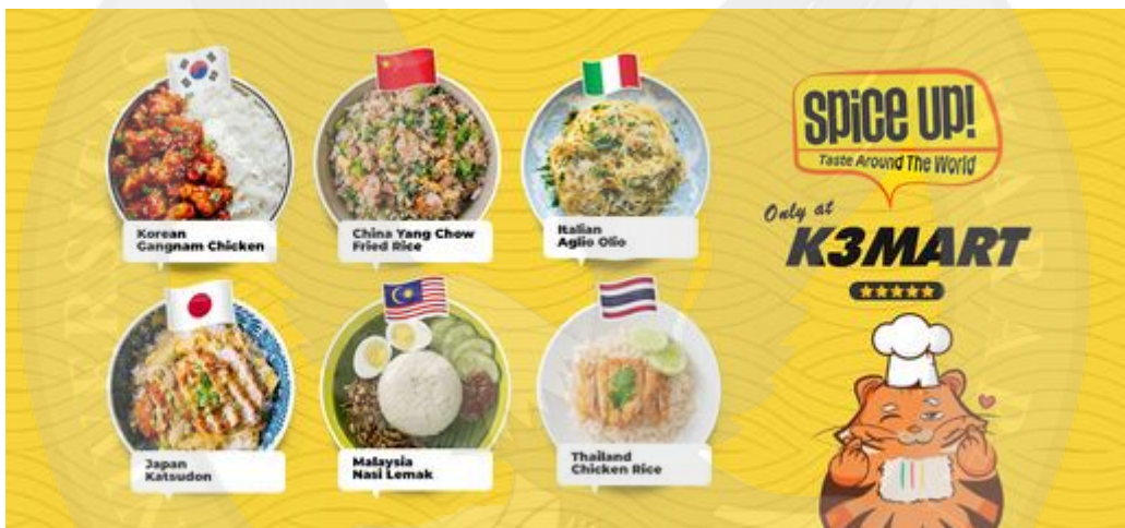
Figure 1. 7 Merchandise Variety at K3 Mart Merdeka

Figure 1.7 show that K3 Mart Merdeka various products with quality and in accordance with the wishes of customers so as to create satisfaction. Many food products that follow the trend as well as other goods products are again hits. In addition, the overall product is quality and safe from defects and at a price that is classified according to the product. K3 Mart Merdeka offers a variety of brands that the majority of food from imports so that food brands that are less known by many customers.