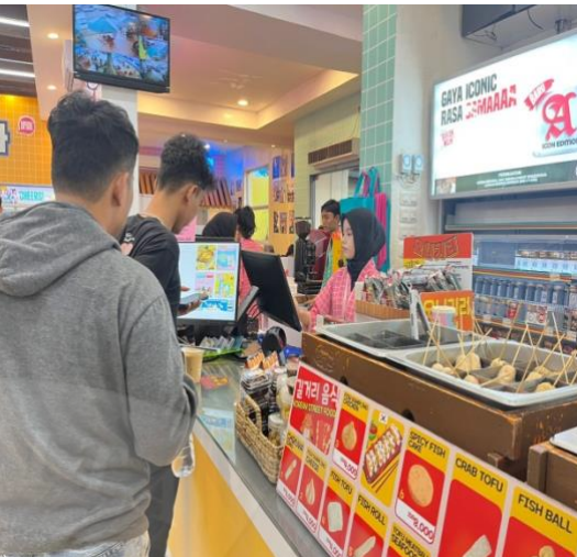
Figure 1. 6 Interaction with staff on K3 Mart Merdeka

Staff at K3 Mart Medan provide satisfactory service as seen from Figure 1.5 and Figure 1.6. The staff has friendliness in communicating, helping customers. Some complaints from customers stating that the special staff yes cashier who is less competent in serving seen from sometimes when K3 mart is crowded, then when customers ask questions related to the product you want to buy less well served. When Saturday and Sunday staff are overwhelmed because of the crowds of customers so often the service provided is quite slow.