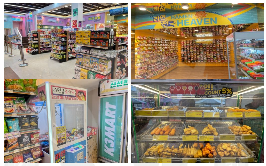
Figure 1. 4 Internal Shop Environment

and service groupings, shelf space allocation, product locations and their role to encourage buying, also form part of the internal shop environment factor.