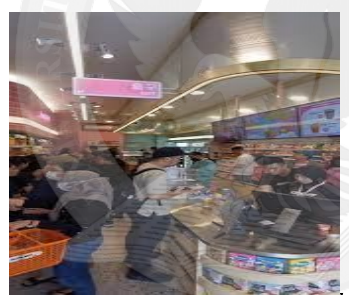
Figure 1. 9 Presence Interaction other Customers on K.3 Mart Merdeka

According to Tombs and Kennedy (2016), presence interaction other customers is a frequently "takes on a supplementary or substitute role to the personal selling efforts of the service employee and may greatly impact on customer satisfaction and perceptions of service quality. Brocato et al. (2014) suggest that the importance of investigating the impact of the presence of other customers is to ascertain what their influence is on the assessment of a customer's in-store shopping experience. In-store customer shopping experiences are largely social activities that can be influenced extensively by other customers' in-store behavior and interaction.