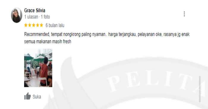
Figure 1. 3 Customer Review of Merchandise

for what you pay", suggesting that merchandise value is a compromise between money spent and the benefits offered by a supermarket.