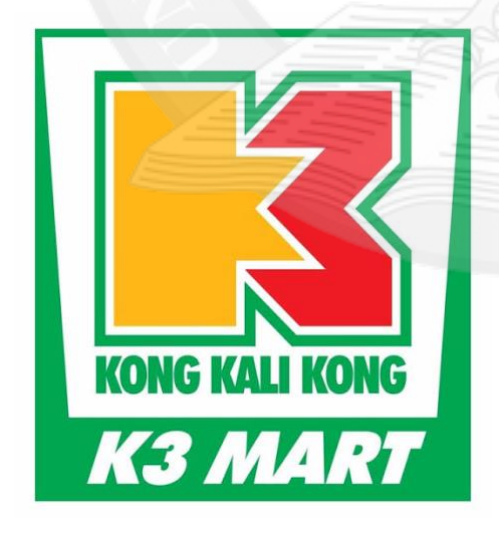
Figure 1. 1 K3 Mart Logo

K3 Mart is one convenience store that centers on lifestyle products, both imported food and beverage products and also local products and MSME products.