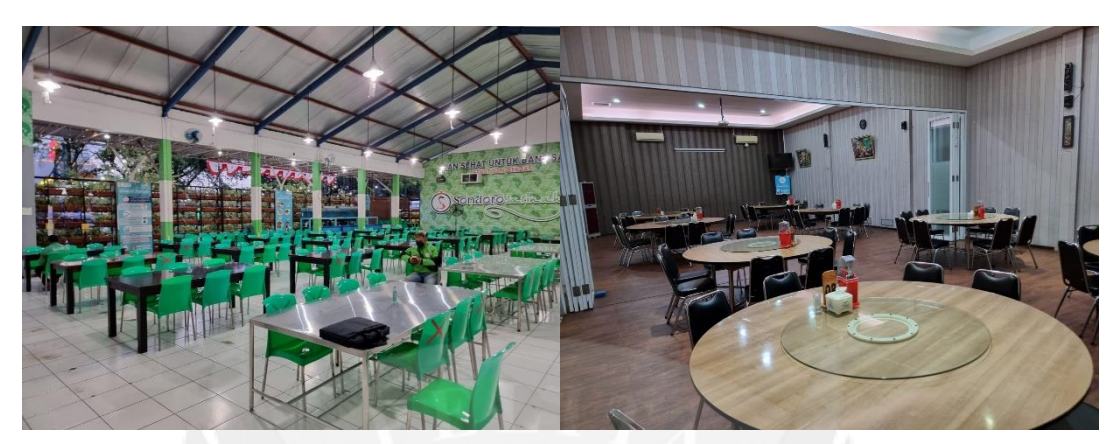
Figure 1.2 Restaurant Conditions at Sondoro Safinah