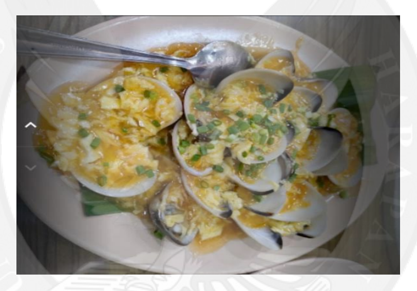
Figure 1.3 Portions of Food at Sondoro Safinah

From the results of Google's reviews, it shows that consumers still complain about the quality of the food served, which is still too salty which shows that the food served is not fresh because of the salty taste. The portion of food served is also still too small. Here's a look at the menu at Sondoro Safinah.