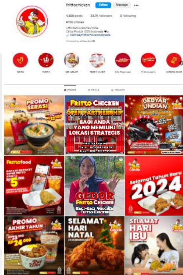
Figure 1.3 Instagram Appearance of Fritto Chicken

Here's a look at Fritto Chicken's Instagram.