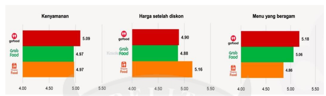
Figure 1.2 Online Food Delivery Statistic