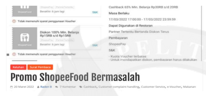
Figure 1.6 ShopeeFood Promotion Complaint

promos has become less frequent compared to earlier times. Initially, ShopeeFood promos could offer discounts of up to 60 percent; however, presently, these promotions have declined, reaching a maximum of 55 percent or even lower.