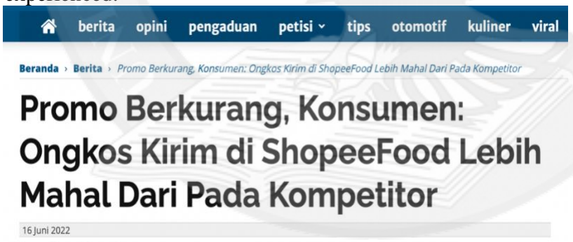
Figure 1.5 ShopeeFood Promotion Complaint

Can be seen in figure 1.4 the problem above is a problem related to the service quality variable (X1), Experienced by consumers is the mistake of the Shopeefood seller in providing products that have been ordered by consumers, so the response from Shopeefood in the complaint is to provide compensation vouchers for the losses experienced.