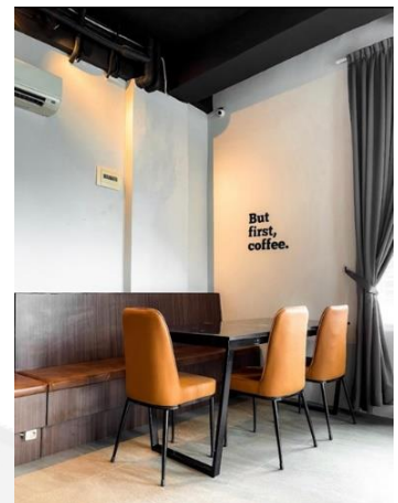
Figure 1.4 Store atmosphere of Glory Coffee Medan