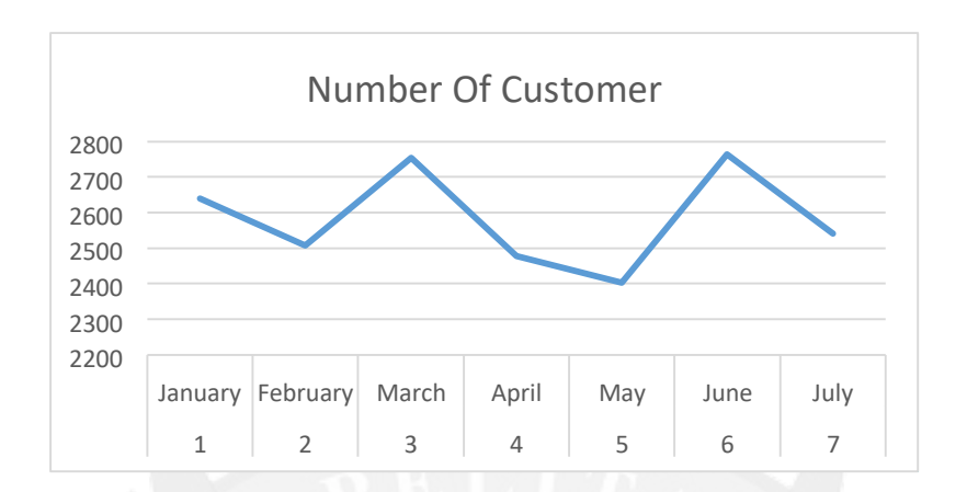
Figure 1.1 Number Of Customer Graph