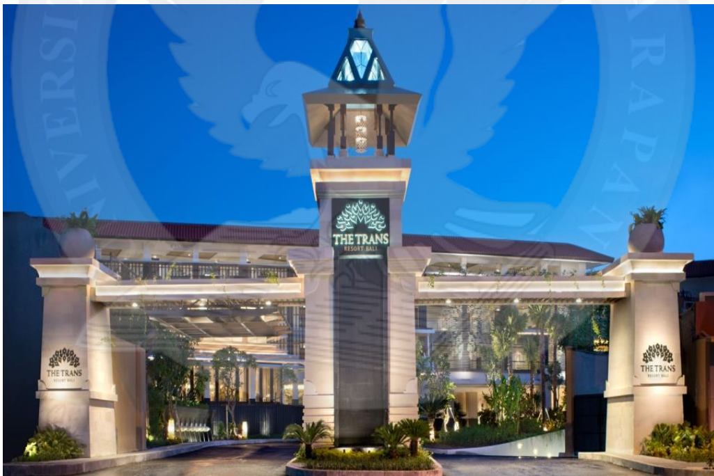
Figure 1.3 The Trans Resort Bali Source: The Trans Resort Bali (2023)

In Indonesia, CT Corp, often known as CT Corpora, is a well-known business that works in a variety of industries. Mr. Chairul Tanjung created CT Corp, which is the owner of well-known TV networks in Indonesia including Trans TV and Trans7 as well as major supermarket chains like Transmart and Carrefour. With Bank Mega and AlloBank, they are also present in the financial industry. Furthermore, CT Corp. operates Trans Studio Bali and Trans Studio Bandung in the entertainment industry. Last but not least, CT Corp owns several renowned hotels, including The Trans Luxury Hotel, Fashion Hotel Legian, Ibis Bandung, and The Trans Resort Bali.