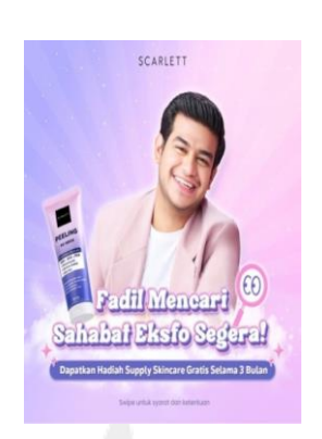
Figure 1.4 Scarlett Whitening Influencer

Not only well known influencer ,Scarlett also works with micro influencers, who are more affordable and involve a larger number of people in the product promotion process. This is seen in the picture below, where macro influencers use videos to promote Scarlett whitening products and post them on social media.