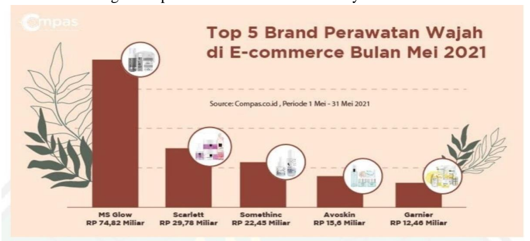
Figure 1.1 Top 5 Skincare In E-Commerce

brand. As a solution, Scarlett's "Reveal Your Beauty" campaign gives Friends of Scarlett the courage to express their own sense of beauty.