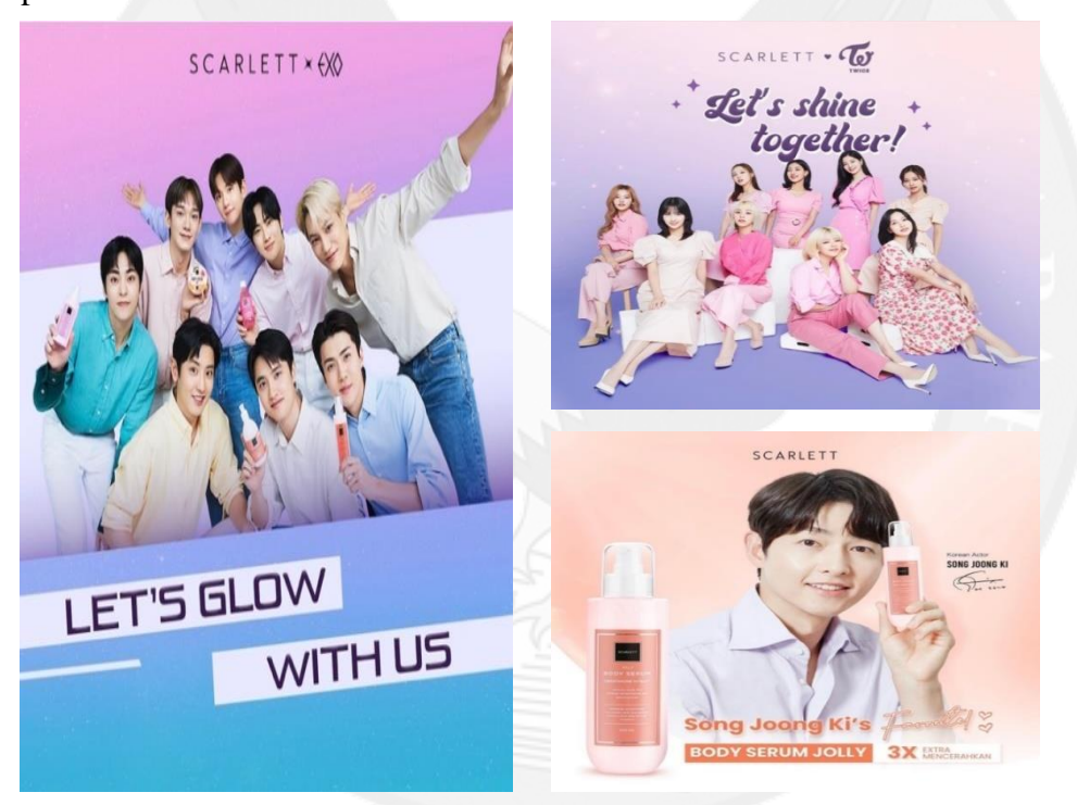
Figure 1.3 Scarlett Whitening Brand Ambassador

in a favourable response. As brand ambassadors that function as promotional platforms or advertisements for their skincare products, Scarlett Whitening has official collaborations with Korean celebrities like as the girl group Twice, actor Song Joong Ki, and boy group EXO. Where the Korean actor and idol has a significant and enthusiastic fan base in Indonesia, it is expected that they will be able to demonstrate how their fame can affect consumers' memories and stick in their minds, leading to consumer purchasing decisions for the products they promote.