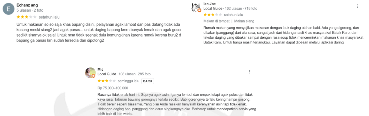
Figure 1.3 Food Quality Reviews at BPK Saksang Goyang Lidah