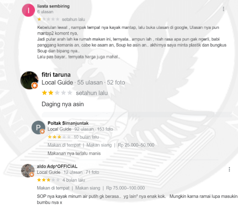
Figure 1.4 Food Quality Review at BPK Sembiring

The following picture below is the Food Quality review of BPK Sembiring.