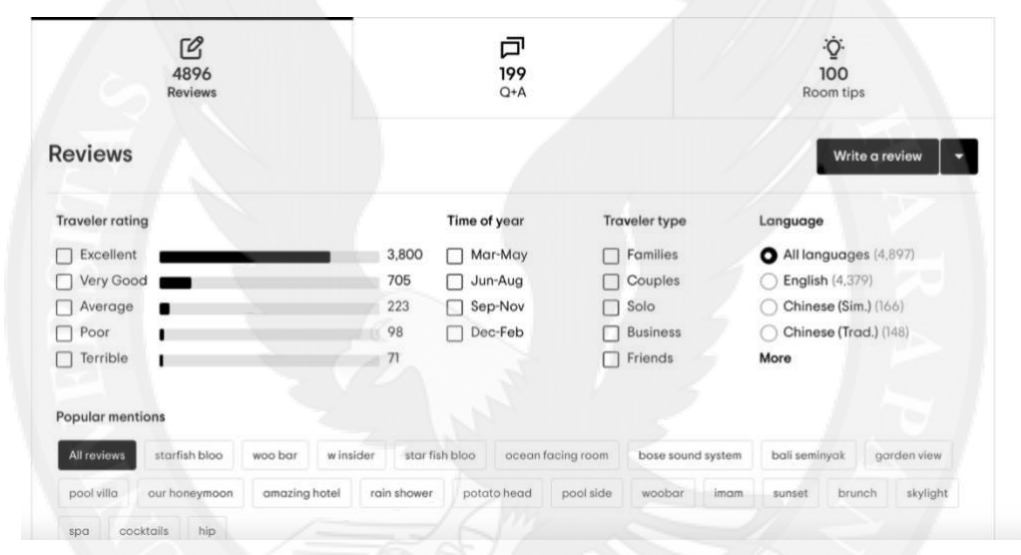
Figure 1.1 Guest Rating and Feedback at W hotel Bali

The ratings and feedback submitted by customers on the Trip Advisor site, as shown in the example above, indicate that there is a lack of service quality, training, employee involvement, and the brand image among the personnel. Guest feedback and evaluations show that W Bali Seminyak employees rarely interact with one another, lack communication skills training, and do not function well as a team. As a result,