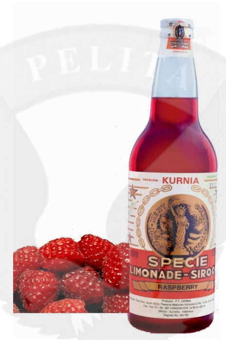
Figure 1.2 Sirup Kurnia

Hudaya. Sirup Kurnia is very popular with many groups, ranging from children, teenagers to adults, because it contains 100% pure sugar originating from Lampung and Thailand as the main ingredient Sirup Kurnia and added to its superior raspberry aroma.