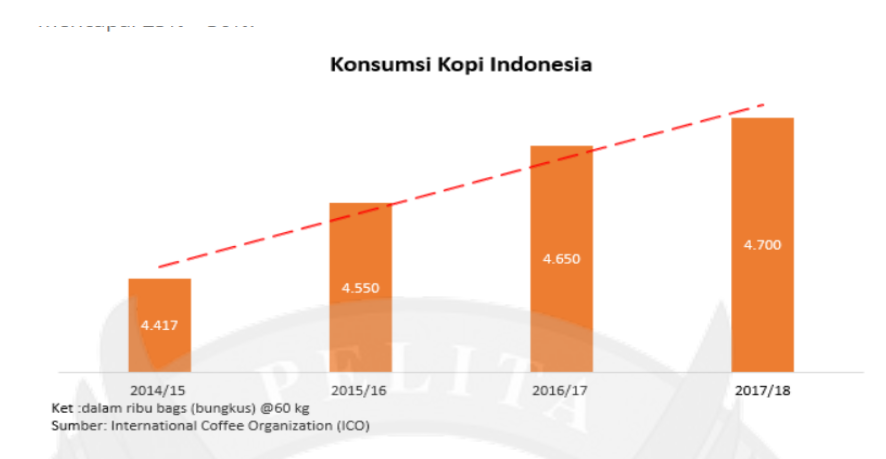
Figure 1 The consumption of coffee each year in Indonesia. Source: Prepare by the writer (SWA.co.id, 2024) Data from the International Coffee Organization (ICO) The data reveals that

the consumption of Indonesian coffee is consistently on the rise over the years. This is also in line with the growth of domestic coffee production which at the end of 2017 reached 666.692 tons. Source: (Hendi Pradika, 2019)