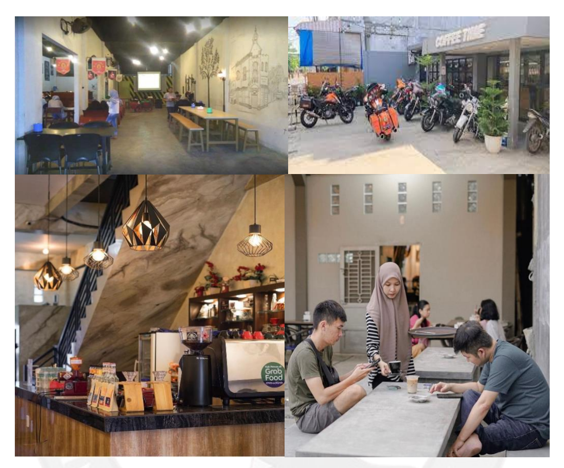
Figure 1.1 Store Atmosphere at Caffeine Coffee Tebing Tinggi

difficult for consumers to park their vehicles and consumers feel uncomfortable because the café does not have an air conditioner.