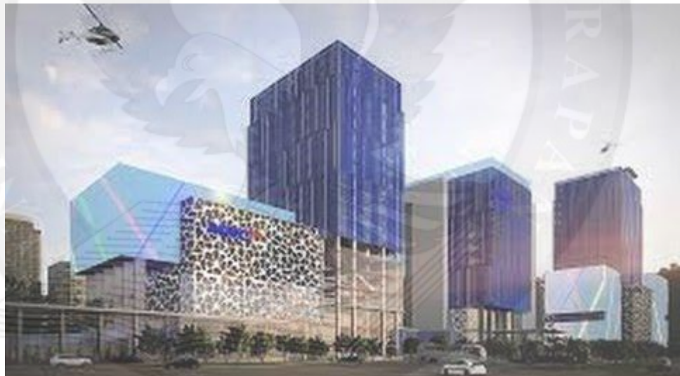
Figure 1.2 MNC Media tower in Kebon Jeruk

The location in where intern did her internship program is located in Jakarta with the address “MNC Studio, Jl. Raya Perjuangan, Kebon Jeruk, Daerah Khusus Ibukota Jakarta , 11530, Indonesia.” Intern officially started her internship program since the first of August 2018 and will end the intern program on 31 November 2018, intern serves at least 640 hours or 4 months in the company. Workday applies from Monday, Tuesday, Thursday, and Friday work time starts from 17.00 until 00.00. There were times where the intern was told to come to the office to cover a program or as a standby during the weekends or holidays and also sometimes intern was asked to come earlier or stay back for the purpose of shooting.