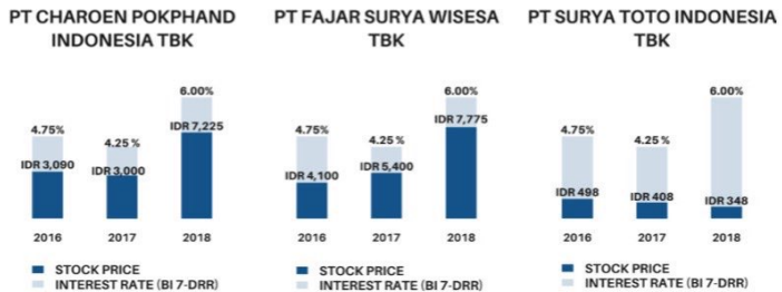
Graphic 1. 3 Interest Rate and Stock Price of Three Companies at Basic Industry and Chemicals Sector for year period of 2016-2018