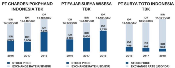
Graphic 1. 2 Exchange Rate and Stock Price of Three Companies at Basic Industry and Chemicals Sector for year period of 2016-2018