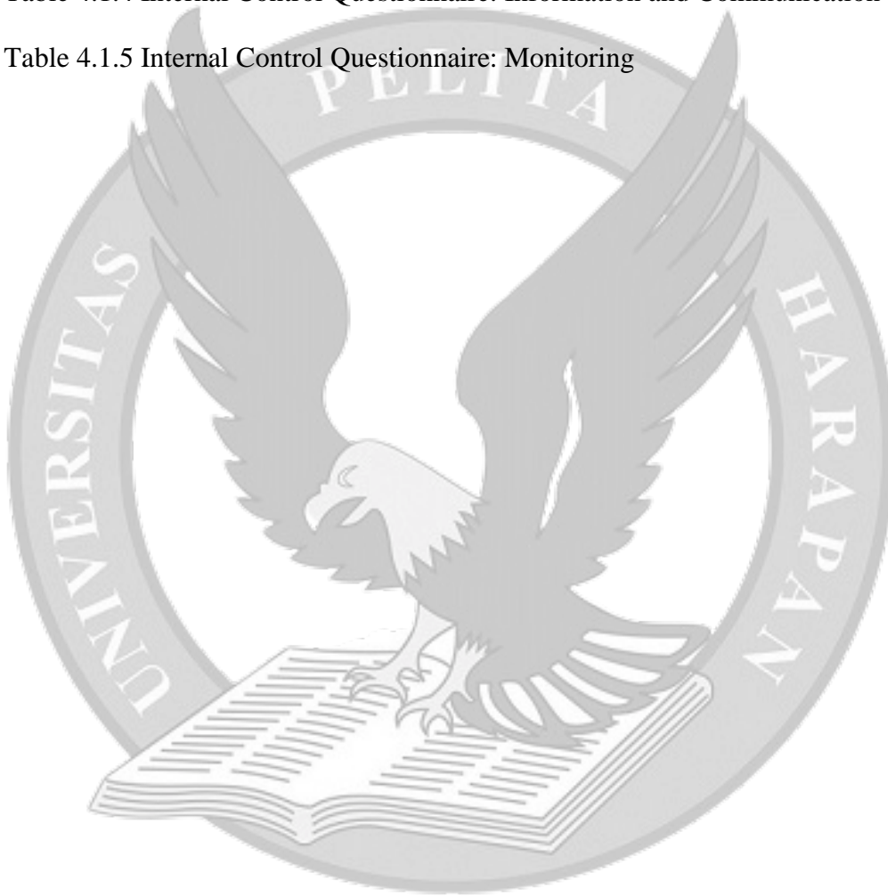
Table 4.1.5 Internal Control Questionnaire: Monitoring

Table 4.1.4 Internal Control Questionnaire: Information and Communication