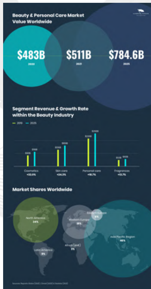
Figure 1.1 Beauty & Personal Care Market Value Worldwide

The beauty industry is currently experiencing very rapid development in the era of globalization. This industry contributes significantly to economic growth. Beauty products are now one of the most essential requirements for the majority of women around the world (Somnaikubun et al., 2020). They believe that beauty products can make their appearance more attractive and the majority of them will continue to follow the trend of new cosmetics brand launches on the market (Rajan et al., 2019a). It has become a daily basis to use beauty products by every level of society, and their consumption is increasing every year.