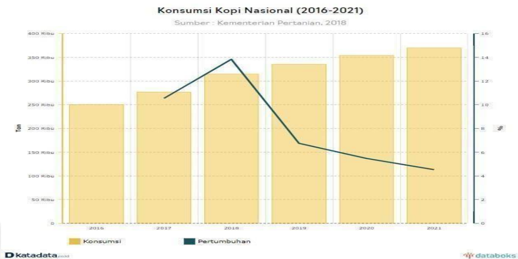
Figure 1.1 national coffee consumption

Consumption rate of coffee in Indonesia continues to increase from 2016-2021, which has been estimated to reach 370 thousand tons.