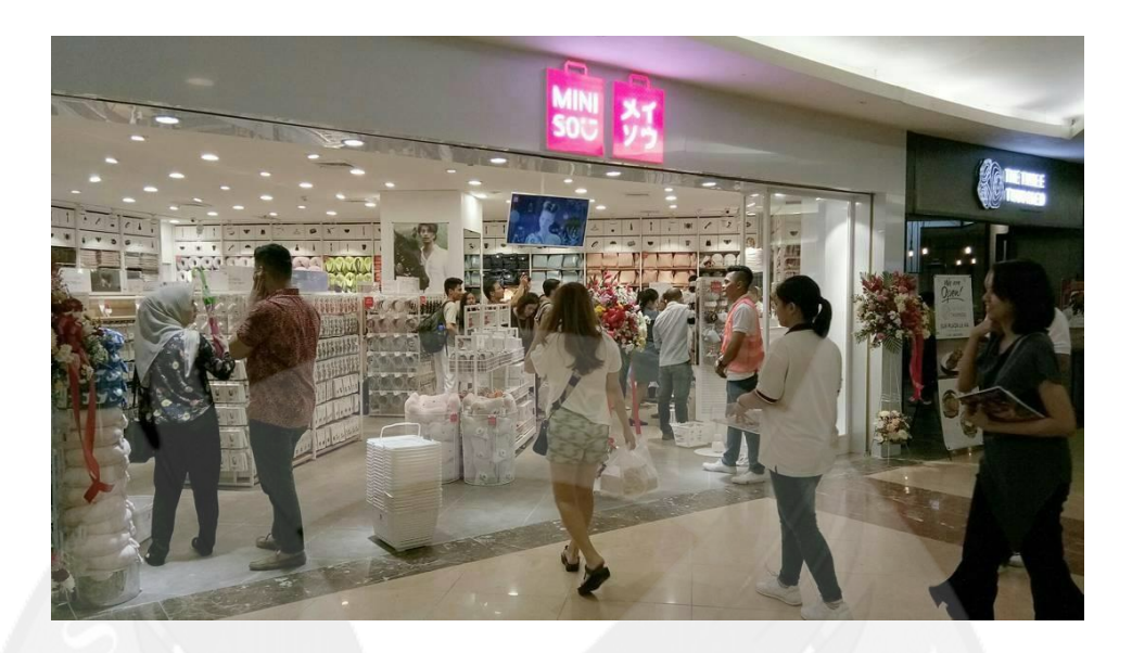
Figure 1. 1 Miniso Store in Sun Plaza Medan

clean. Some of Miniso best seller items are earphone, perfume, sandals, and water bottles.