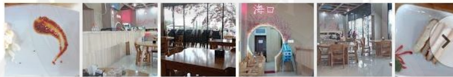
Figure 1.3 Haikou Restaurant Complaint

Untuk pelayanan perlu di tingkatkan lagi.. Pelayan tidak siap untuk menerima banyak nya pelanggan..