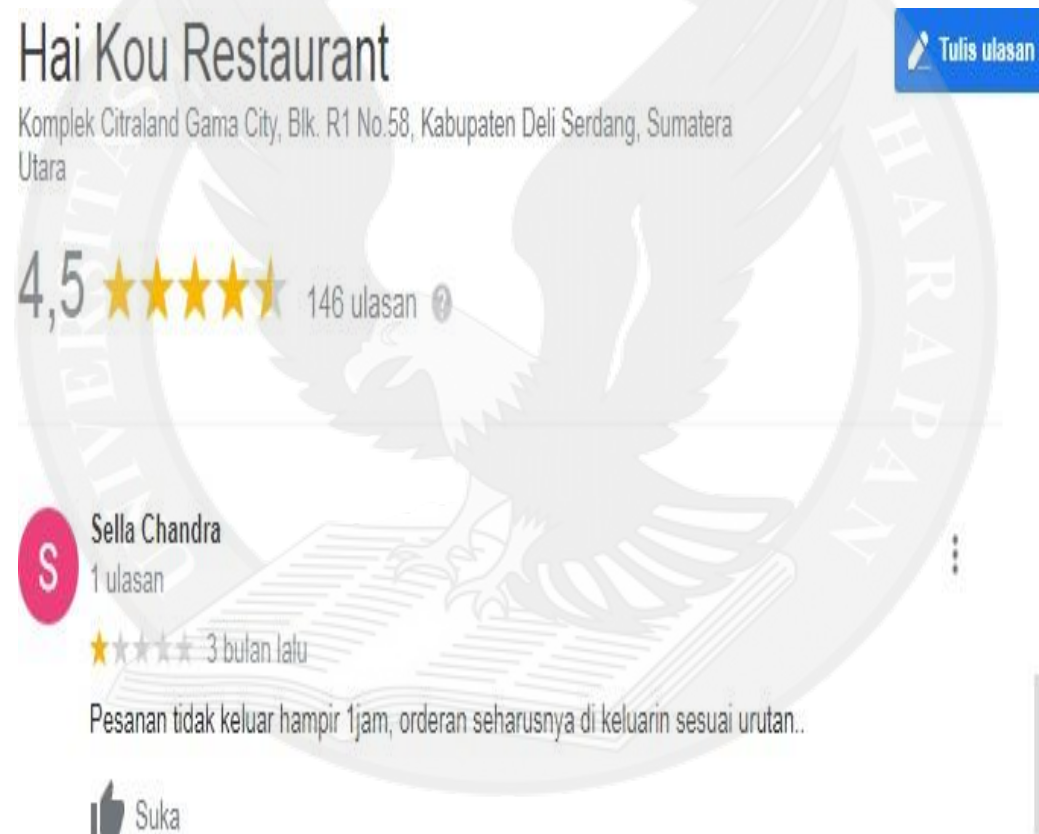
Figure 1.2 Haikou Restaurant Complaint

service. buy product. In this case, the service provided by Haikou Restaurant has always been considered disappointing due to its slow operation, responding to several things by consumers. In addition, employees are also considered to never smile while providing service and rarely greet consumers in a friendly manner, such as service giving out a menu and immediately going to another job. without requiring consumers to order immediately or view a menu in advance. Some of this makes consumers unhappy and not recommending it to other consumers.